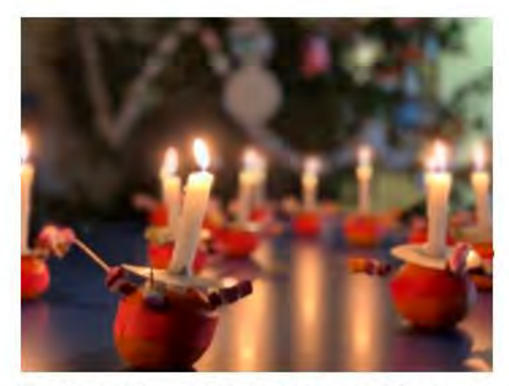
The light shines in the darkness, and the darkness has not overcome it. John 1:5.