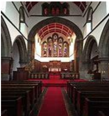
The Chancel and East window of St Luke's