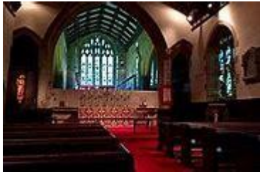
The Chancel and East window of St Peter's