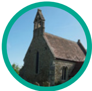
Mepal St Mary Page 13