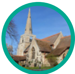
Stretham St James Page 14