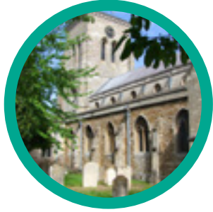
Haddenham Holy Trinity Page 10