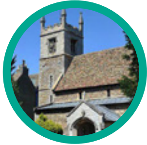
Little Downham St Leonard Page 11