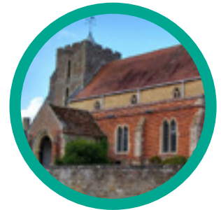
Witcham St Martin Page 18