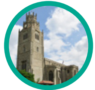
Sutton St Andrew Page 15