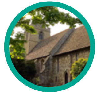
Wentworth St Peter Page 16