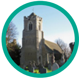
Coveney St Peter ad Vincula Page 9

The following pages give details for each of the individual parishes in the group