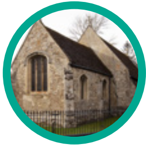
Little Thetford St George Page 12