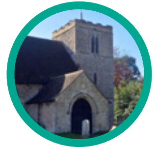
Witchford St Andrew Page 19