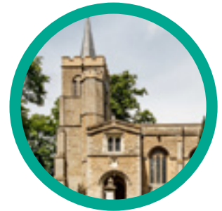
Wilburton St Peter Page 17