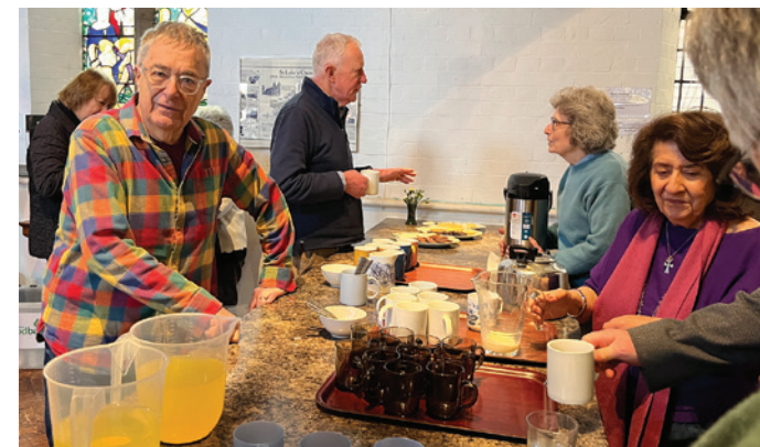
"Catching up" after a service