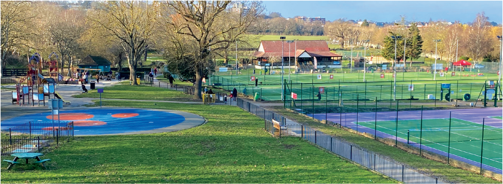
Shops and Restaurants at the bottom of Arthur Road