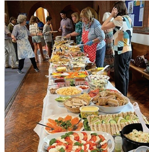
A typical, after service, 'bring and share' lunch