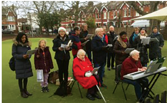
Carol singing at the Farmers' Market

The area has a wide choice of state and independent schools, with the Ofsted outstanding Wimbledon Park primary school in the parish, though not formally linked to St Luke's, and several CoE primary schools in neighbouring parishes. St Cecilia's, a nearby comprehensive, has a strong Christian foundation and St Luke's regularly supports the Christian Union there. The parish is in the catchment of several highly regarded church-based state secondary schools including Lady Margaret, Fulham Boys and Greycoat Hospital, plus other Ofsted "outstanding" or "good" local schools and the Tiffin Grammar schools in Kingston. There is also a good choice of local nurseries.