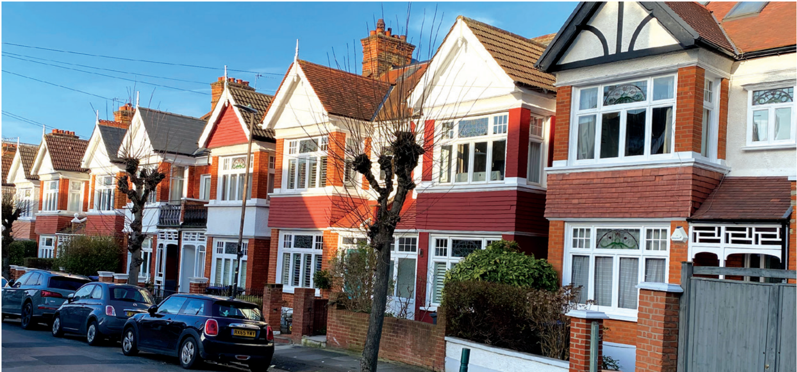
A typical road in the parish

The church owns a house and 6 flats (three houses subdivided) in the neighbourhood which have been left as bequests by members of the congregation (some with restricted covenants). Two flats are used for housing a parishioner and a staff member; the others are currently let commercially. The house is presently rented by an ex-curate who is now a vicar at a nearby church.