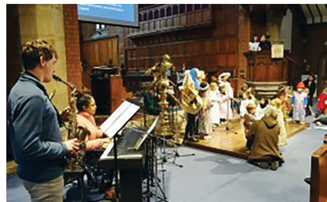
Rehearsing for the 'All age' Nativity service