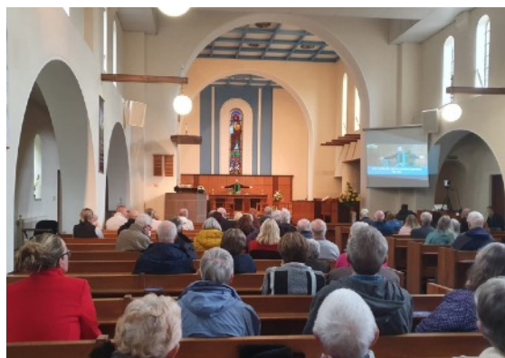
Team Worship Service, which happens on fifth Sundays at St Matthew's

As mentioned above, our parish used to be two parishes of Thatto Heath and Eccleston Park. Our boundaries encompass a diverse mixture of reasonably affluent areas of private sector housing combined with a large estate of social housing and new community housing. In addition, there are several sheltered and supported housing schemes, and a hospice. The diversity of housing types presents a range of different challenges and opportunities. Overall, our parish is in the top 12% of deprived parishes in England.