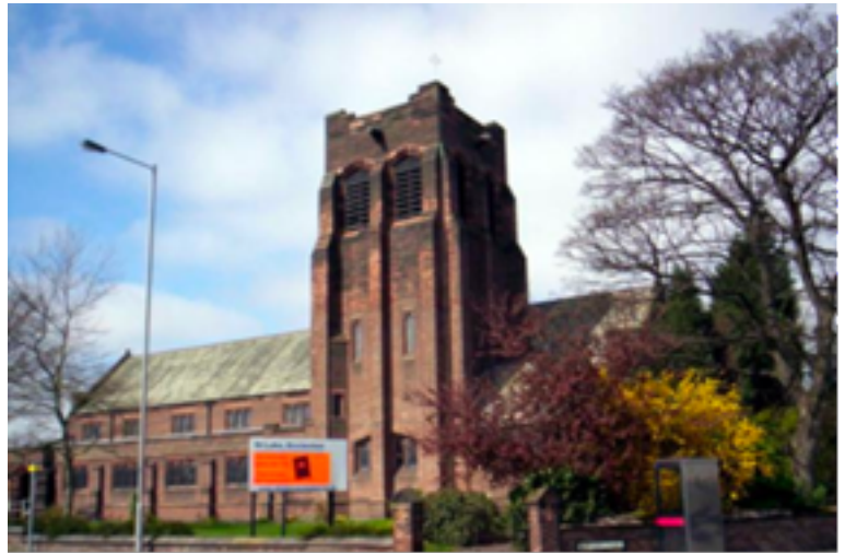
Our building is prominently located on Knowsley Road

Our church building was opened just over 90 years ago, and is in good repair. About 15 years ago it was re-ordered and the pews were replaced by chairs. This means that we now have an open plan church giving flexible space to accommodate different styles of worship and opportunities for other events such as our Family events. It's also occasionally used for conferences or music events. We're blessed to have high quality audio and visual equipment (and a great team) which means we can live stream our services.