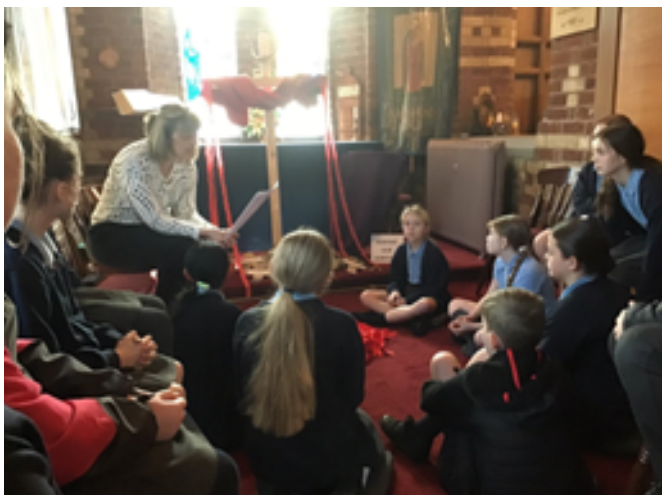
Year 6 Children visiting our Annual Easter Journey

Our Schools Ministry team was established September 2023 by our clergy, and is now led and directed by lay volunteers. It includes members from all our team churches, representing a team effort to reach the children in all our parishes. As a team we host events and services for our local schools. Sometimes these events are in school, and often they are in our church buildings.