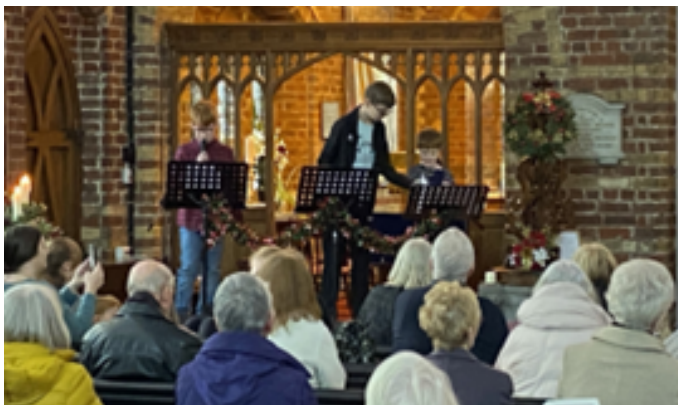
Some of our children leading the Nativity Service

Our Kid's Church was developed at St Johns in April 2021 and has flourished since, usually welcoming between 10-20 children on a given week, and many more for special festivals and services. It particularly suits primary school aged children, and the church is currently exploring