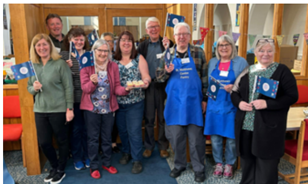
Some of the St Matthew's Food Pantry Team

The Parish is predominantly residential and in parts rural, including the edge of the internationally renowned Knowsley Safari Park. There is now little in the way of industry or commercial premises in the parish other than some local shops, Thatto Heath local centre and several public houses. There are several other churches from a variety of denominations within the parish, 3 primary schools, a few nurseries and Carmel Sixth Form College stands on the parish boundary. We enjoy a particularly close relationship with Eccleston Lane Ends, and are also involved with Nutgrove Methodist Primary School, and make occasional connection with St Austins, a Catholic Primary School.