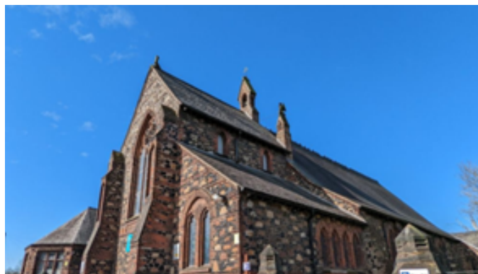
Our church is located on Crossley Road, in Ravenhead

For the last few years we've been on a journey of increasing financial health. Following the pandemic our annual deficit in 2021 was around £34,000, and our reserves were nearly depleted. The PCC has worked really hard for the last two and a half years to increase income and decrease expenditure. Even with sharp rises in utility costs, we're a lot closer to break-even point. During this whole time we continued to pay our full parish share (approximately £40,000). At one point we needed helped with a gift from St James church to pay for three months parish share, which is evidence for the way our churches work and operate as a true team. Our reserves currently stand at around £20,000. In the future, we want to go further than break even as we're keen to invest in our building and more importantly begin to invest more in mission and reach more people with the good news.