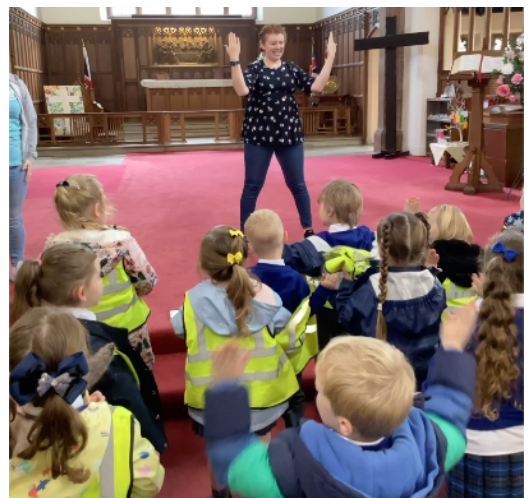
A Reception Class visiting St Luke's and learning a worship song

Our Team has two busy and thriving food pantries, located at St Luke's and St Matthews., Together, they serve hundreds of households every week, representing thousands of meals for local families and thousands of volunteer hours every year. This is our church's response to the cost of living crisis. Our pantries also dramatically reduce food waste, helping the environment. Our customers can access a wide array of support services through the pantry, as well as making friends and building relationships. This is a key mission field for our churches, and so as well serving people in the moment we use the opportunity to build friendships, make connections, invite to church and to special events and services. Our pantries work together, and work well with other local pantries and food banks, often supplying one another when someone is short. God has been incredibly faithful to our pantries, proving to us week by week that when we share, there is always enough for everybody.