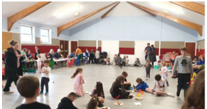
Family Fun Event in the Community Centre on Shrove Tuesday 2024

We have a community centre which can be accessed independently. In 2023 it underwent a redecoration, following some issues with flooding. Now it is reopen it is well used by the community. It consists of a large hall, two smaller meeting rooms and a fully functioning kitchen. We have toilets facilities including one with disabled access, and baby changing facilities. At the front of the centre we have an Eco Garden which we want to encourage the users of the centre/ community to maintain and develop. Unfortunately, this has been held up due to COVID-19. We would like to increase the use of the centre for community needs.