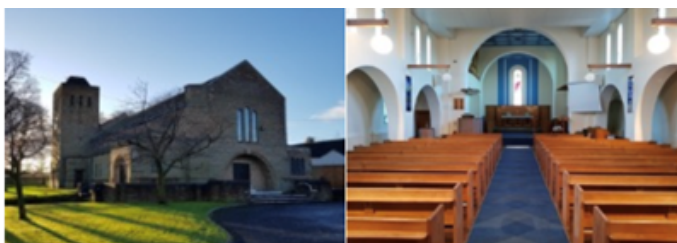
St Matthew's Church and Community Centre

In terms of numbers our worshipping community has struggled to bounce back since the pandemic, seeing regular numbers about half of what they were prior to 2020. However, in recent months we have welcomed new faces and seen the return of some members who have been missing for a while. We've also seen some key roles being filled in the last 12 months, (including treasurer and warden) and the PCC are