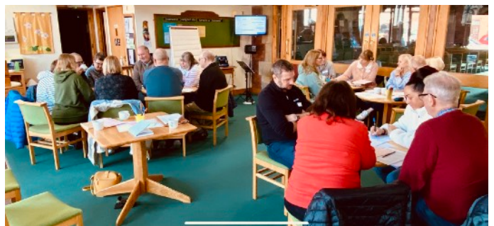
Our PCCs meeting to pray, discern a shared vision and make priorities for 2024.

This vision gives us some clear direction as we reach out, as a team, to our parishes. There's always more that we would like to do than we can actually do. We want our vision to be a filter, helping us say 'yes' to initiatives that help us achieve it, and 'no' to initiatives that don't. We also want it to act as a refiner, helping us reflect on our mission and activities, making sure they are Jesus-centred, reaching all age groups, and serving the people in our town in ways that are meaningful, and communicating God's love.