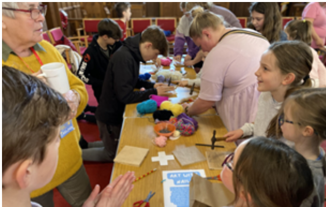
Our Annual "Good Good Friday" Service

Occasionally, (especially around major festivals) we offer one-off cafe-style worship services which are always well-attended. Our Kid's Church began at the start of 2022 and have a number of regular families and many occasional families who now rely on our weekly children's provision. Our average attendance currently stands at 57 adults and 9 children. We have a number of home groups, some online and some in person, though in practise almost all of the midweek groups in our team are open to and enjoy members from all churches.