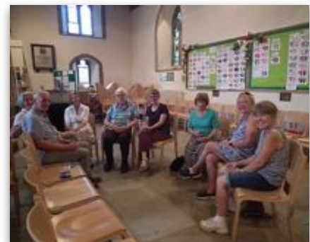
A group discussion in church

Home groups are a very important part of our church life and approximately half the congregation are in one of the seven groups. They variously meet weekly or fortnightly, mostly in people's homes. Members provide support and encouragement for each other as they journey in faith, developing deeper relationships with God and each other.