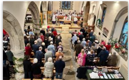
Holy Cross congregation Christmas Day 2023

We regularly offer a wide range of worship designed to appeal to a broad spectrum of worshippers, held in both the church building and also the nearby Memorial Hall.