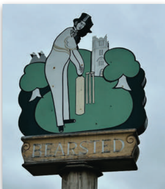
The Village Sign

Bearsted is a semi-rural village in easy reach of the Kent coast, the channel ports and the Channel Tunnel. It has good motorway links and a railway station (within walking distance of the vicarage) on the Maidstone East line between London and Ashford (Kent). Buses also run to Maidstone and Ashford.