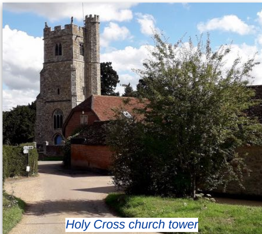
Holy Cross church tower

The church is a large, grade 1 listed building situated in an elevated position near the village green in Bearsted, a village at the foot of the North Downs, approximately 3 miles east of Kent's county town of Maidstone. It extends approximately 1.5 miles from east to west and 1 mile from north to south.