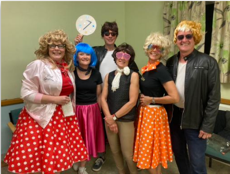
One of the Harvest Supper "acts"

This group also organises evening events, including the Maundy Thursday and harvest suppers and refreshments to accompany the APCM. They also ensure Holy Cross is represented at the Bearsted carnival and fayre, as well as other village events.