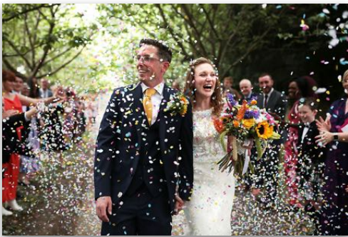
A wedding celebration outside Holy Cross

The church is also the centre of significant events in people's lives with blessings of births, baptisms, marriages and funerals, and special services to celebrate marriage, Mothering Sunday and Holy Cross Tide. In a typical year we would expect to have around 10 weddings, 17 baptisms and 30 funerals, of which roughly two-thirds are administered at the crematorium.