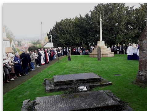
Remembrance Sunday at Holy Cross