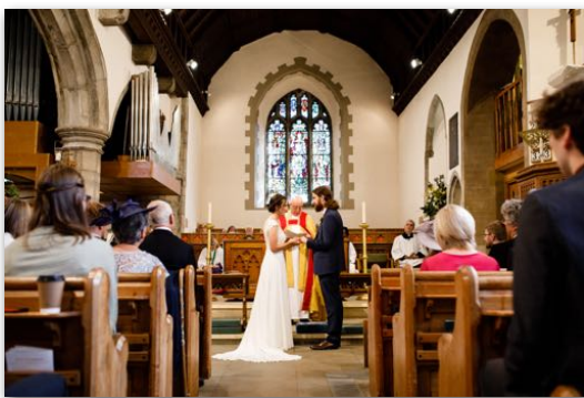
A church wedding

We have good community links and try to play our part in village life to share the Gospel message. In 2023 we removed the pews from church in order that we could hold more events for both church and community, including concerts and dinners, nonetheless respecting our place of worship with high quality chairs. We are a popular venue for weddings, baptisms and funerals.