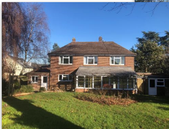
Vicarage rear view

It is a four-bedroomed house with an adjoining garage set in a mainly lawned garden. Downstairs there is a lounge (with an open fire), kitchen/dining room (with separate utility room), study/office, cloakroom with shower and an orangery. Two of the bedrooms (including the master) have built-in wardrobes, one bedroom has a sink.