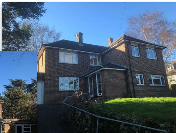
Vicarage front view

The vicarage is a short walk from the church and is accessed via a private shared access road.