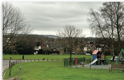
Village Green and Play Area

The picturesque village green is the venue for various community events including an annual summer carnival and fayre. Bearsted Cricket Club has its pavilion and pitch on the green: the game has been played here since the eighteenth century, making it one of the oldest cricket grounds in England. Additional leisure facilities include allotments, a tennis club , a bowls club , two golf clubs and football clubs covering all age ranges . The two Holy Cross flower festivals brought many of these groups, along with the Parish Council, other churches, the schools and WIs, together in an enjoyable cross-community event.