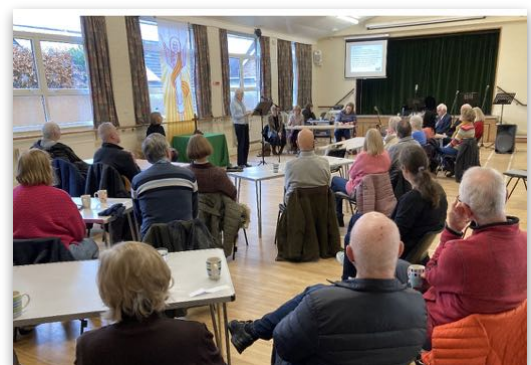
New Way service in the Memorial Hall