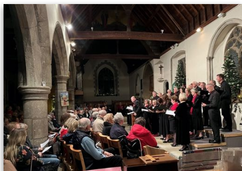
Mixed Blessings Christmas concert in church

Villagers can enjoy many other activities/groups, which meet in church buildings or in the three community halls in the village. The Scouts and the Guides have their own land and buildings not far from the church. There are a number of choirs including Bearsted Choral Society and Mixed Blessings, a thriving local history society, and four Women's Institutes.