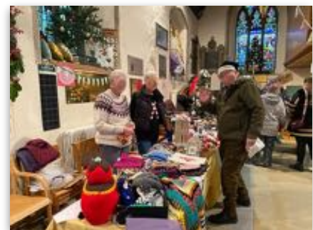
The Christmas Fair

Significant milestones in church life are celebrated with wine and food at church, organised by a dedicated Social Committee.