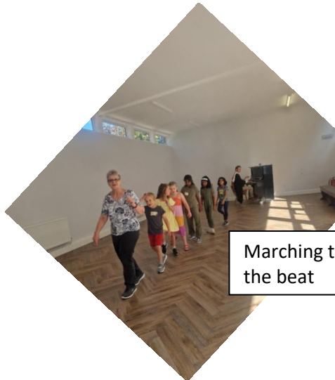
Marching to the beat