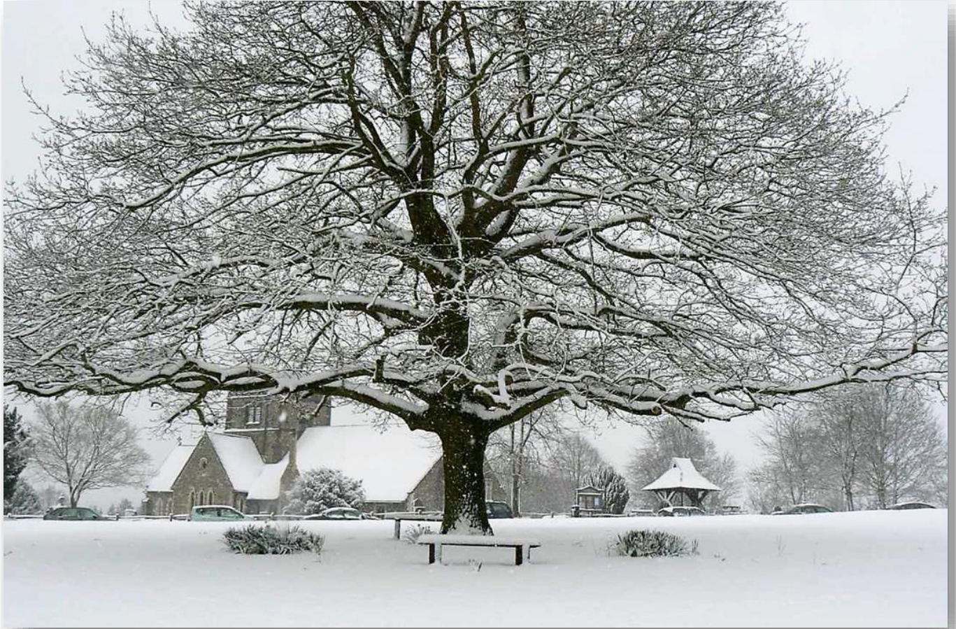
St Margaret's Church, Church Lane, Chipstead, CR5 3RD