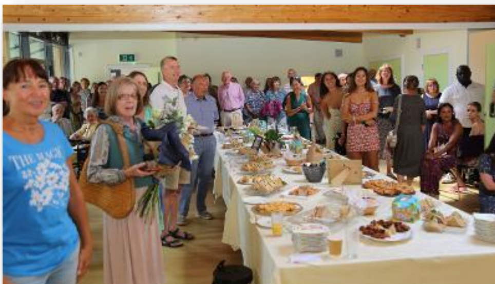
Together in the Orchard

All this is only possible with God's help. We are committed to working with our new Rector to making this a living reality for our church family and all those whom God sends us.