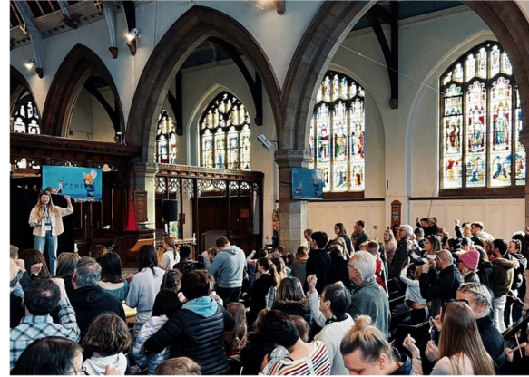
Worship in the Diocese of Lincoln

The diocese through its churches, chaplaincies and projects is deeply committed to the flourishing of the whole population and embedded in every community across Greater Lincolnshire. Through, for example, our church schools growing children, young people and households we are committed to healthy, inclusive structures in society. The diocesan environmental policy, including a commitment to carbon net zero by 2030, informs all our work from buildings and investments to ministerial and faith training. We have a carefully implemented ethical investment policy for our historic assets. The diocese invests heavily in continuously improving the quality of our safeguarding performance.