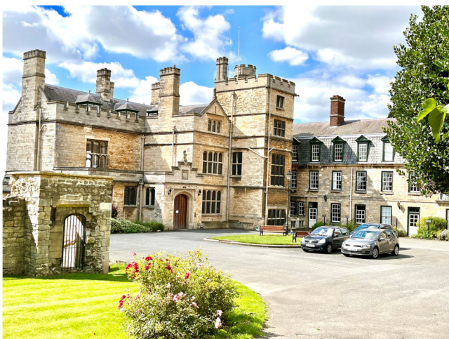
Edward King House

Our aim is to grow the Church, in both numbers and depth, through attention to what we see as our core tasks of faithful worship, confident discipleship and joyful service, with the vision of being a healthy, vibrant, sustainable church which leads to transformed lives and communities across greater Lincolnshire making a difference in God's world. To that end as a diocese we shall support, encourage and enable local parishes, schools and mission partnerships to fulfil, within this framework, their own unique calling to serve in mission the community in which they are set.