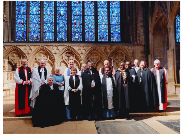
2023 Racial Justice Sunday service at Lincoln Cathedral