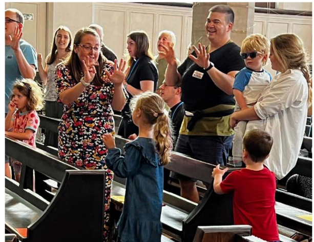
Worship for everyone at St Faiths in Lincoln

Time to Change Together, an integrated approach to growth, deployment, staffing, costs, investments, and voluntary giving launched in 2022, is starting to deliver major benefits in terms of working practice and support for our voluntary and paid staff in the parishes, and in levels of income and in care of our precious and vast range of church buildings, that they better