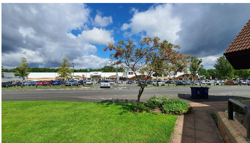
Kingston Park Shopping Centre from St John's

Newcastle upon Tyne is a vibrant city with excellent facilities including shops, hospitals, arts venues and museums, sports facilities, and a good public transport network. The universities and colleges attract a large number of students.