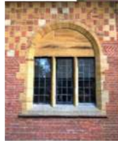
The Wisdom of God