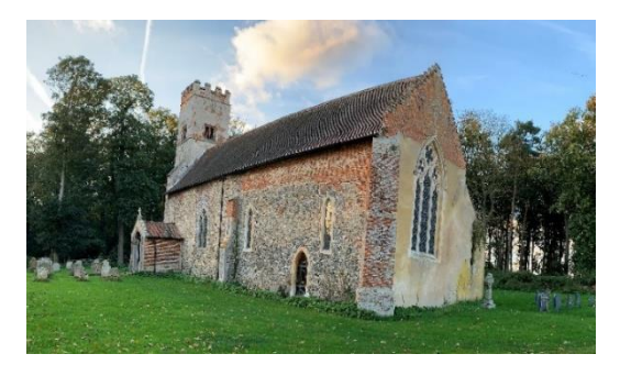
St Michael and All Angels, Oxnead