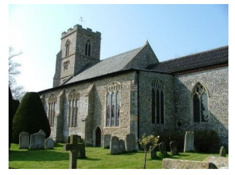
St. Andrew's Church, Buxton