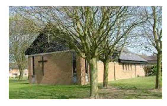
St Ed's Community Church, Badersfield