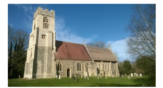
St. Mary's Church, Burgh-next-Aylsham