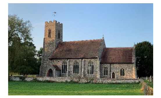
St. Andrew's Church, Lammas