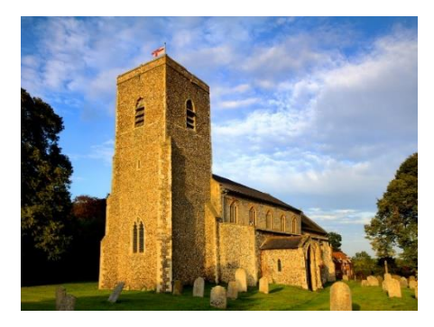
All Saints, Marsham

With primary pastoral responsibility for the parishes of Badersfield, Brampton, Burgh-next-Aylsham, Buxton with Oxnead, Lammas and Marsham