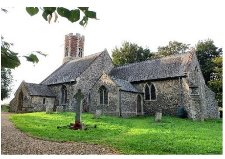
St Peter's Church, Brampton