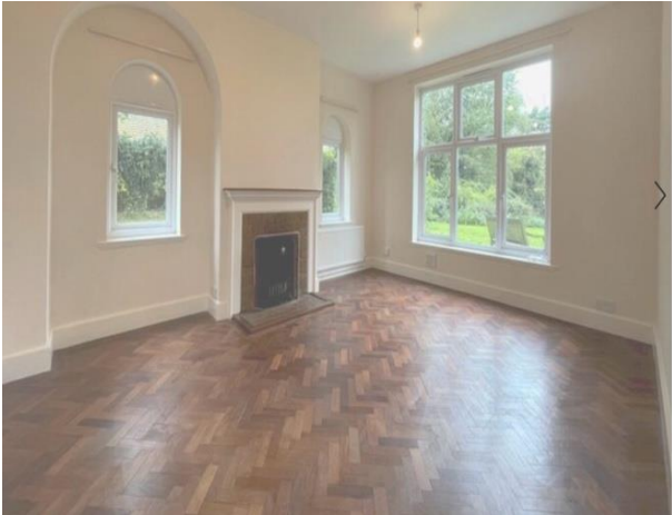
Sitting Room looking to rear garden