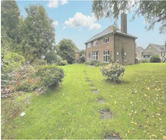
Rear garden with footpath to church