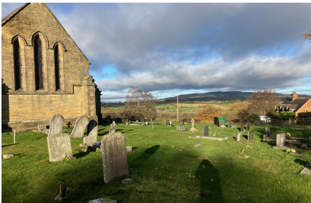
Image: View towards Brown Clee from the churchyard.