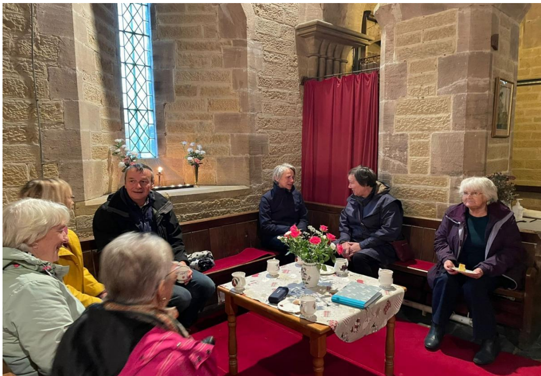
Image: Coffee Morning in our church

St Mary's generally has a congregation of around 4 people; this swells fivefold for our Harvest and Christmas Festival services.