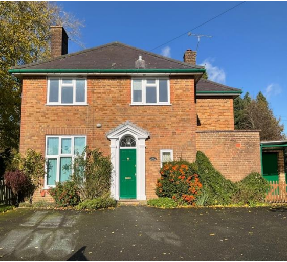
< Road frontage from the School opposite