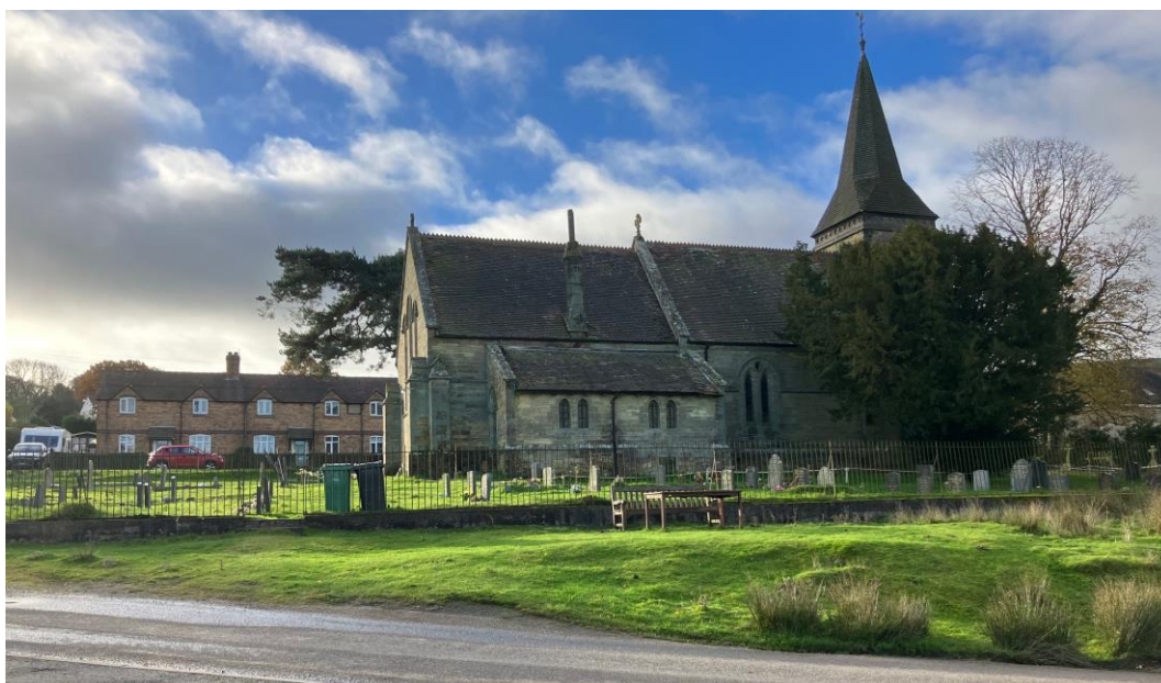
Image: St Mary's Church with the Almshouses behind