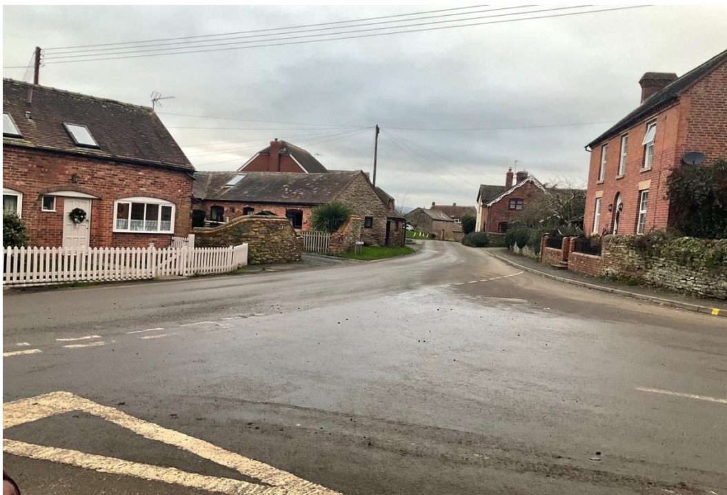
The (Market) Square, Stottesdon looking west

Stottesdon's pre-eminence was thus assured despite the change of king; in 1244 William's distant successor Henry III issued a Royal Charter allowing a weekly Market on Tuesdays (in The Bull Ring and The Square – road names that have long-outlived the market). The nearby church was surely the community meeting place and it's porch-altar a cash settlement point on those market days?