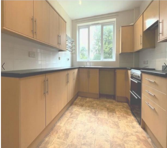
Kitchen looking to rear garden