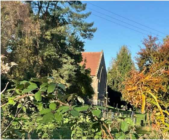
< Chancel from across the rear garden