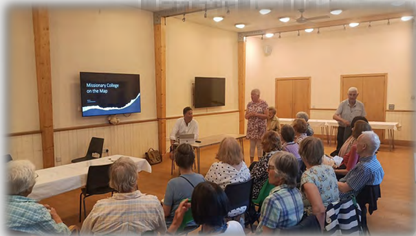
Meet, Eat and Explore

Other facilities include a smaller meeting room, a children's room/second meeting room, a choir room, main hall and a fully equipped kitchen; all are available for hire via an online booking system and the facilities are increasingly used by local community groups .