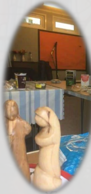
Advent Posada visiting the Community Larder on Spring Lane