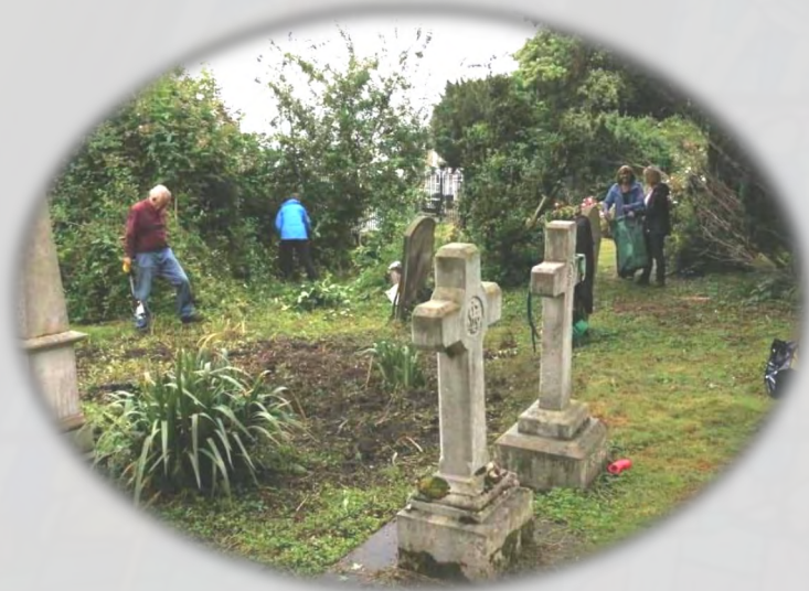
Parish Eco-Group: St Martin's Churchyard Working Party (St Paul's has an Eco Silver Award)