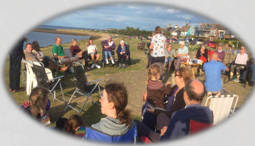
Mothers' Union annual fish supper on the beach, Whitstable 2023