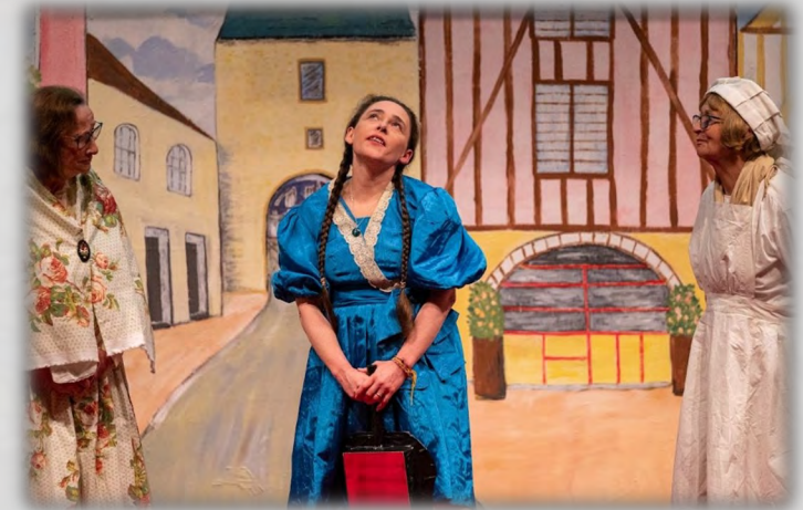
Parish Pantomime: Beauty and the Beast 2024 staged in St Paul's