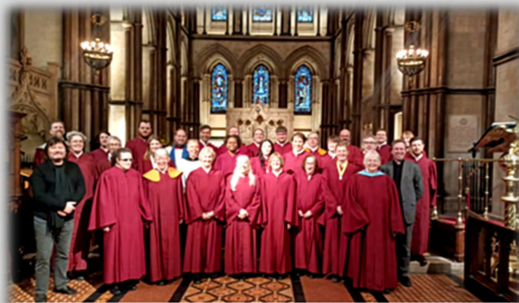
Choir Visit to Rochester Cathedral 2024