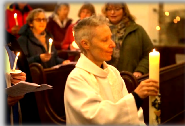
Easter dawn service at St Martin's 2024