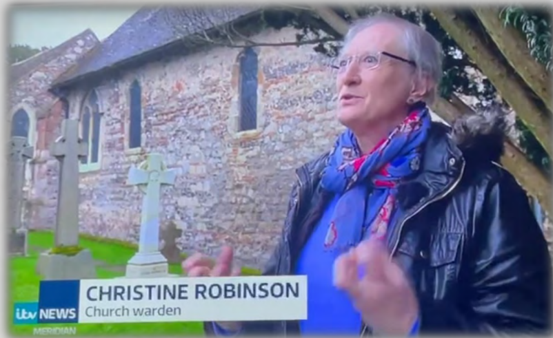
St Martin's on ITV Meridian News for International Women's Day 2024, focusing on Queen Bertha