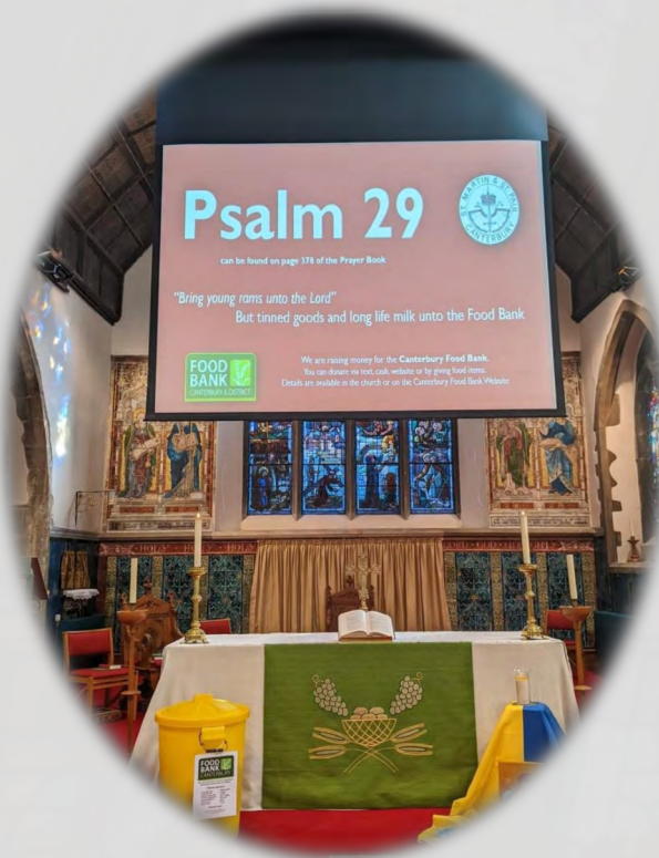
24 hour PSALMATHON in aid of the foodbank