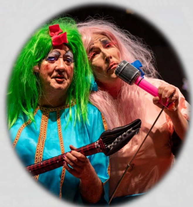
The Dames: Beauty & the Beast - 2024