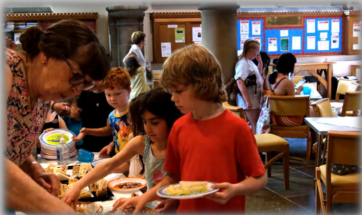
St Paul's @ TeaTime