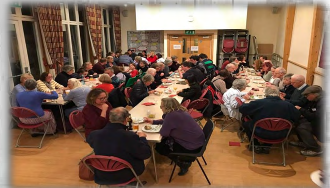
Evensong & Supper