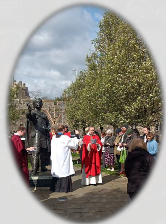
Palm Sunday procession from Lady Wootton's Green to St Paul's 2024