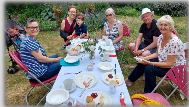
Strawberry Tea - 2023