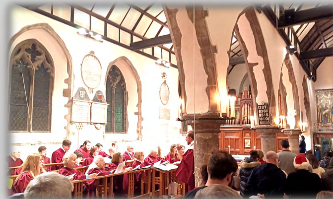
Choral Evensong and supper at St Paul's

Having made the headlines, and been replicated in churches across the country, St Paul's has a well-known reputation for its Choral Evensong and Supper. This proudly traditional service consists of full Sung Choral BCP Evensong with Authorised Version readings lead by our ministers and choir. Each service has a theme and a guest preacher. Worship is followed by supper and fellowship in the Parish Centre next door. This service is attended by around 60 people from across a wide geographical area , of different ages and different church backgrounds. Along with the music, the highlights are our interesting and diverse guest preachers and of course drinks, supper and fellowship afterwards. This service is live streamed on our YouTube channel.