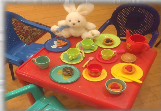
Fisherfolk Toddler Group

Our social activities draw people from across the city, different local churches and those on the edges of our parish life. The facilities enable us to undertake a range of other activities but also as a place to learn more about the Christian faith, such as hosting "Meet, Eat and Explore" talks.