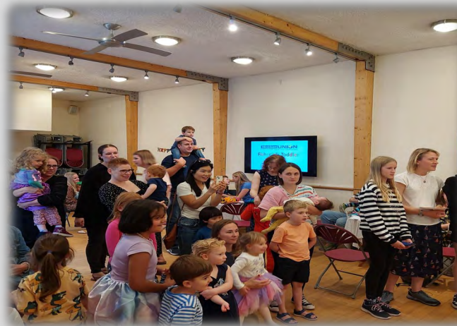
Fisherfolk toddler group 30 th birthday party