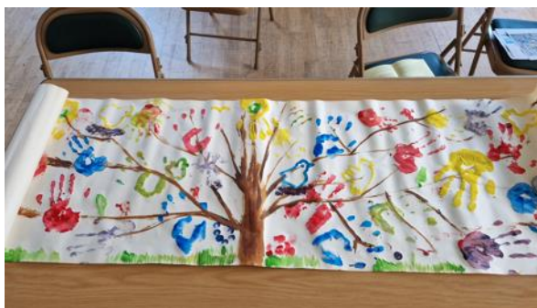
Young Church Creations

Young Church at St Andrew's is a vibrant and growing community of parents and children who meet each Sunday during the Parish Eucharist. Our Young Church programme is going from strength to strength and is a source of particular pride and excitement for our current church community.