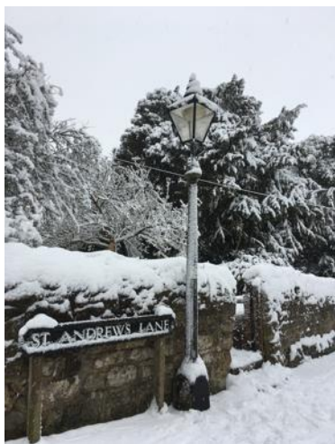
St Andrew's Lane by a Church Gate

Our clergy also regularly attend several retirement and nursing homes in the parish, ministering to elderly and convalescent groups and bringing them the Holy Sacrament.