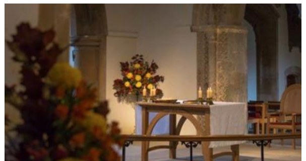
Our Nave Altar

St Andrew's liturgy is deeply sacramental in the modern catholic style. At the core of our worshipping life is the Eucharist and the Daily Office as we seek to respond to the God who in Christ is reconciling the world to Himself. Morning and Evening Prayer is said publicly most days and in addition to the two Sunday services, the Eucharist is celebrated on Monday (CW)