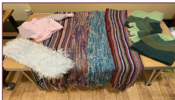
Recent Projects by Knit & Natter

Many years ago, members of St Andrew's launched an outreach project called 'Tea On Monday' (TOM) to provide a social drop-in to help reduce loneliness and isolation in the community. A fresh approach was considered after the pandemic to encourage a wider range of socialisation by adding 'Knit and Natter' to TOM.