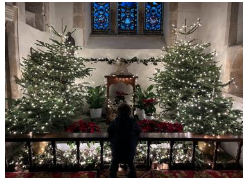
Young Church member praying at the Christmas Crib