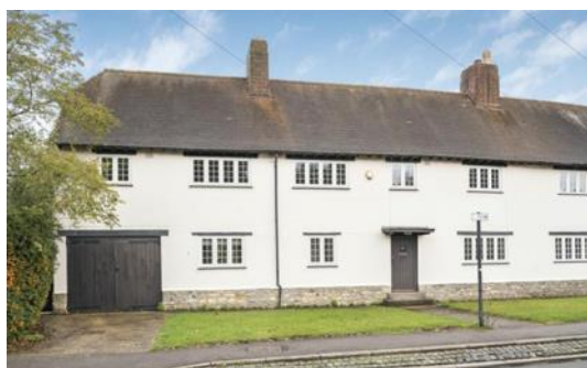
Front of the Vicarage

The Vicarage is sited in St Andrews Road, very close to the church, and was built in 1940, and is an end-of-terrace house. It has been used as the Vicarage since 1977.