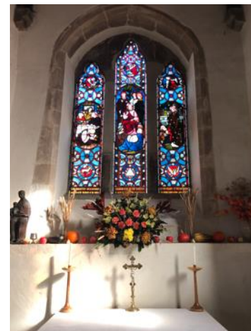
Our Lady Chapel

Our Sung Parish Eucharist then begins at 10am, with a tradition of concelebration and a full team of servers. A variety of congregational mass settings are sung and the choir sings an anthem. Vestments are worn at all Eucharists, the Sacrament is reserved and incense is used at Festivals. The church has a strong tradition of high quality preaching, which is intelligent, informed and challenging, while being accessible to all.