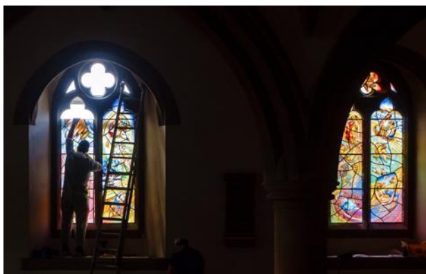
Installation of the new windows

In August 2022 two new stained glass windows were installed to mark the 900 th