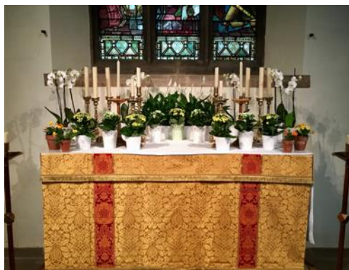
The Altar of Repose

The Eucharist is at the heart of our gathering as a community on Sundays and during the week. We regularly celebrate baptisms and weddings, and our clergy visit