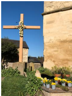
The Easter Garden

Holy Week and Easter follow the traditional liturgical