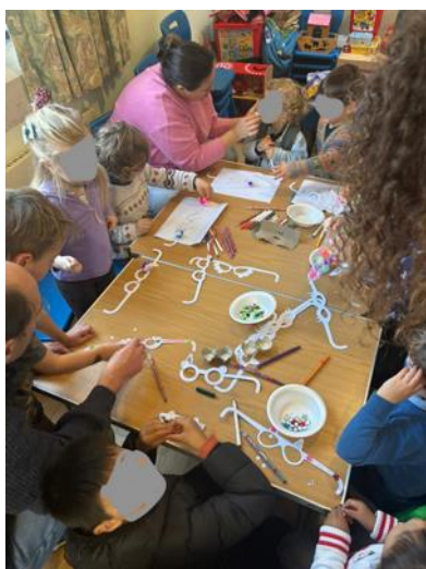
Young Church at St Andrew's

We seek to walk alongside one another in personal and corporate formation. Each September, a group of faithful pilgrims from St Andrew's goes on an annual pilgrimage to Walsingham. We have a growing Young Church programme (more on this below) with an average of 11 young people at our 10am service every Sunday, sometimes as many as 20. One of our additional weekday ministries is a toddler group that reaches out to local families and carers (see Little Fishes below). We are committed to the schools in our Parish,