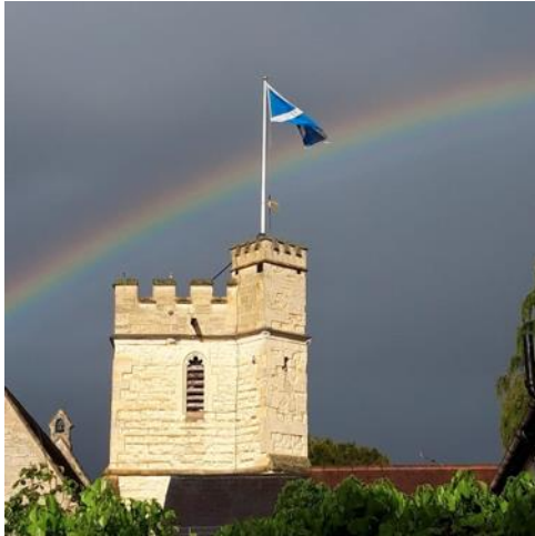
St Andrew's Tower

We at St Andrew's are a liberal, inclusive and affirming congregation. We are composed of people from all walks of life who seek Christ within the beauty of sacramental worship and Christian community.