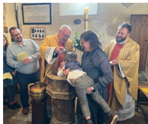
A Baptism at St Andrew's

A significant number of people from the wider parish seek out St Andrew's to support them in life's transitions, both in joy and in sorrow. We celebrate many baptisms, confirmations, and weddings each year. We also give thanks for many of those departed from this life both, through funerals at the church and at the crematorium, only a few miles away in Barton. Many funeral directors based in Headington who trust the clergy of St Andrew's and regularly rely on us to support grieving families.