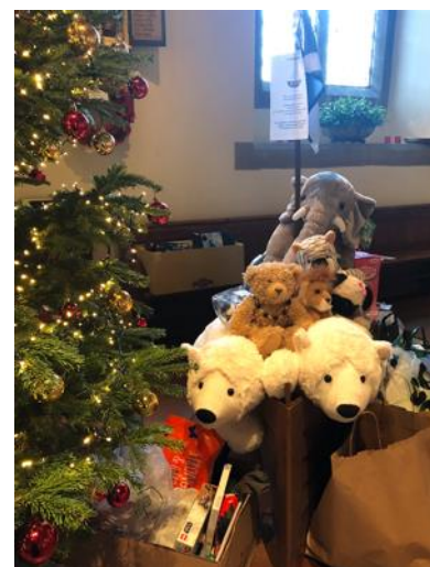
St Andrew’s Boat for the Salvation Army

The Vicar of St Andrew’s has also acted as Chairperson of Headington Parish Charity, a fund dating back to 1902 whose sole remit is to make yearly gifts, usually in December, to needy people within the Parish of Headington. There is an annual meeting of trustees and nominations for recipients are requested from St Andrews Headington, St Marys Barton, All Saints Highfield, and St Ebbs Headington. In 2024, 14 cash gifts were made.