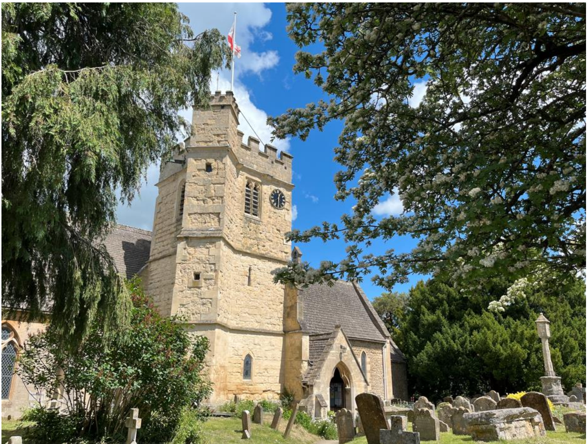
St Andrew's Church from St Andrew's Road