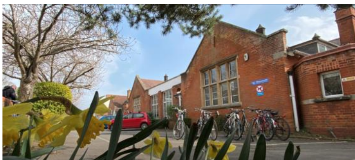
St Andrew's C of E Primary School

There is a very strong relationship with St Andrew's Church of England Primary School (VC). The school is a single-form school with 210 pupils. It is a very popular primary school, and always over-subscribed.