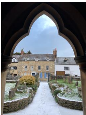
View from the church doors to the White Hart Pub

One of our core values is being a visible presence of Christ's welcome and hospitality in Headington. We are visible from the JR Hospital in the parish and regularly welcome family members searching for a place of quiet and prayer. Numerous members of the local community are clear that St Andrew's is their parish church, even if they are not present on most Sunday mornings. We are committed to ensuring our doors are open all day.