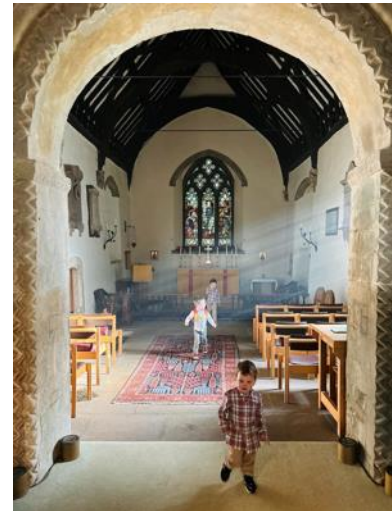
Some of our Young Church

congregation and clergy warmly welcome the opportunity to meet families within the parish, or with a connection to the parish, who seek the sacrament of baptism in our church. Our Young Church children are always invited back into the service at the time of baptism, to remind them of their own entrance into God's Church. Members of the PCC write a card to each person baptised in our church on the anniversary of their baptism; this arrives by post to remind each family that they remain in our prayers and are always