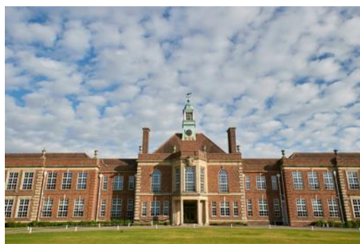
Headington Rye Oxford School

governor. Continued work is needed to identify an effective way of supporting and serving New Marston Community Primary School, a multi-form state primary school. It is part of the River Learning Trust on the Northway Estate, which specialises in the education of deaf children both through a specialist unit and classroom integration.