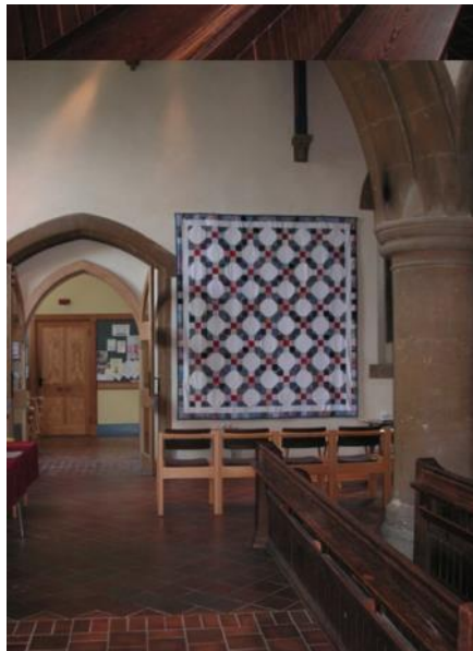
Our Community Quilt

The Friends of St Andrew’s (FOSAC) was established over twenty years ago. This is an organisation which exists to help preserve the church as a local amenity and is a secular group. Originally financed by donations, it has raised and invested a considerable capital sum which supplements the church’s own fabric fund and pays for projects which enhance the look and the fabric of the building. FOSAC also holds an annual Christmas Carols and Readings event which raises a small amount but is primarily a social event which draws in many people who are not regular members of the congregation. It has a constitution and money raised is restricted to use on the fabric of St Andrew’s Church, Old Headington.