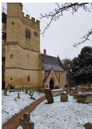
2024 Scaffolding at St Andrew's

The last Quinquennial Inspection was completed in 2020 with the observations noted and implemented in subsequent building works. Some work to the stonework and fabric was completed in 2021, and the cost in part met from the fabric fund, a dedicated allocation within the funds of the church, built up over the last twenty years. At the present time further work in the form of roof repairs and maintenance, as well as repairs to stonework is underway, again with part of the cost met from the fabric fund.