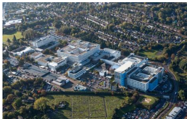
John Radcliffe Hospital