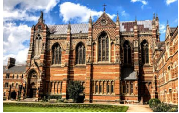
Keble College Chapel

In 2023, St Andrew's launched an exciting Parish Intern scheme in partnership with its patron, Keble College. This unique position is aimed at candidates in the discernment process for ordained ministry in the Church of England. Now in its second year, the Parish Intern programme offers