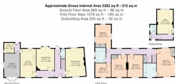
Vicarage Floor Plan