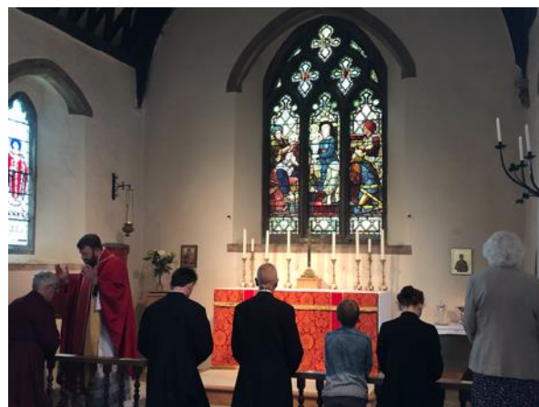
A Curate's First Mass at St Andrew's

Formation is one of our core values and we seek to nurture the next generation of Christian leaders, both through our work sharing the Gospel with children in Young Church, and through our identity as a training parish. In addition to training curates, who have become a close and valued part of our church family, we regularly welcome ordinands on placement or preaching from St Stephen's House, Wycliffe Hall, and Ripon College Cuddesdon, and we have a Parish Intern