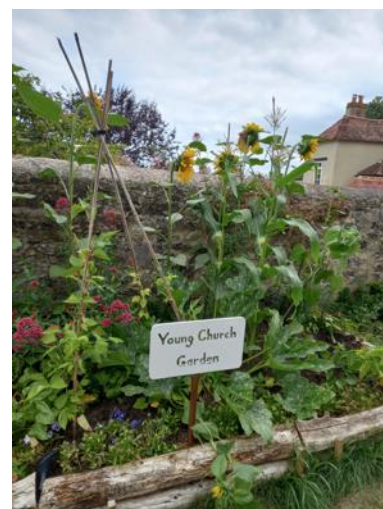
Young Church Garden

The children have their own Young Church Garden and have been learning gardening skills and about caring for creation, as well as letting off steam! The children rejoin the congregation for Communion and are welcomed to the front of Church after the final hymn to share their crafts and learnings with the congregation.