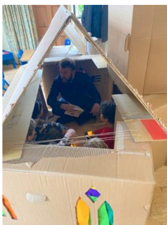
Our clergy also help with Young Church

places in our church, to which children feel called and in which they feel loved. To symbolise this embrace of children, the celebrant hands each child a candle (battery powered!) from the altar during our processional hymn. Especially for those children who do not yet receive Holy Communion, this act offers something tangible to take away from the heart of the church: a light to represent Christ's light.