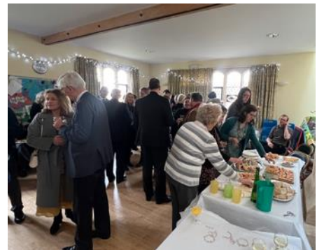
Coffee after Mass in the Church Room

others, including students, nurses, doctors, and academics, who have joined us for a fixed period of work in Oxford. Whoever you are, there is a place for you at St Andrew's and we welcome all into the rich history of Christian worship and fellowship in our church.