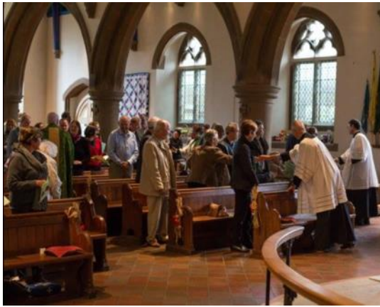
A Sunday at St Andrew's

Our new vicar will join a warm, varied, and faithful community that looks to follow Christ in all that we do. We are seeking someone who will joyfully enact the inclusive love of God in our parish and our community. This person will inspire us in their own close walk with God, their focus on prayer and sacrament, and their desire to share Christ with others through theological reflection and preaching. They will be warm,