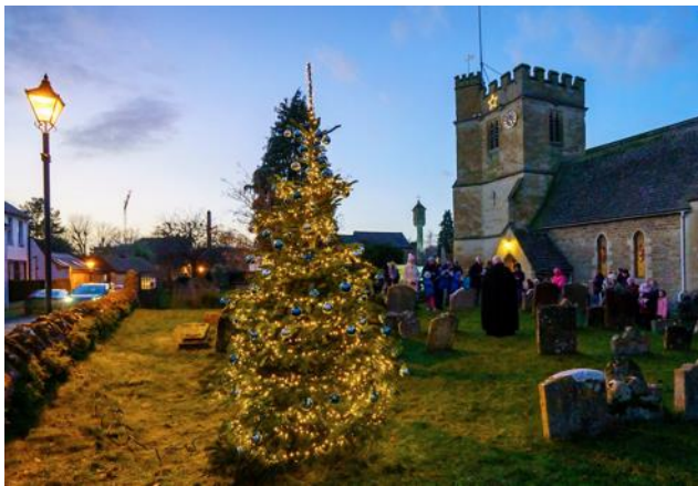
Outdoor Carol Service and Lighting the Village Tree

As Headington grew through the 19 th and 20 th centuries, parts of the original village became separate parishes with their own churches: Holy Trinity Headington Quarry, All Saints Highfield and St Mary's Barton. However, the age and central position of St Andrew's has allowed it to retain a sense of being the "mother" church of the area. Traditionally, only the incumbent of St Andrew's can use the title "Vicar of Headington."