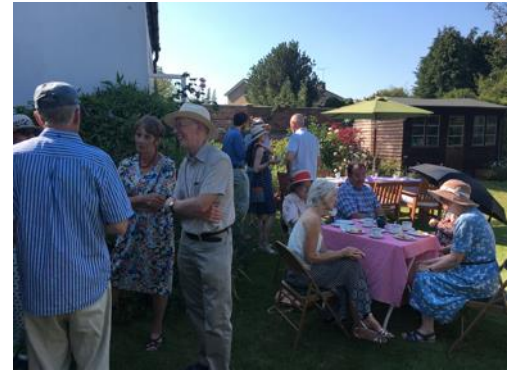
Vicarage Garden Party