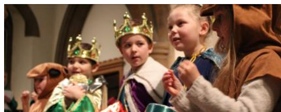
St Andrew's School at Christmas

Andrew's Church of England Primary School where numerous people from our Sunday congregations have served as governors, including our previous incumbent, who was the chairman of the governors for most of his time with us. We welcome children from St Andrew's School to the church throughout the year and maintain a strong, positive relationship with the school's Headteacher.