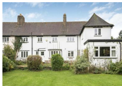
Back of the Vicarage

The Vicarage is sited in St Andrews Road, very close to the church, and was built in 1940, and is an end-of-terrace house. It has been used as the Vicarage since 1977.