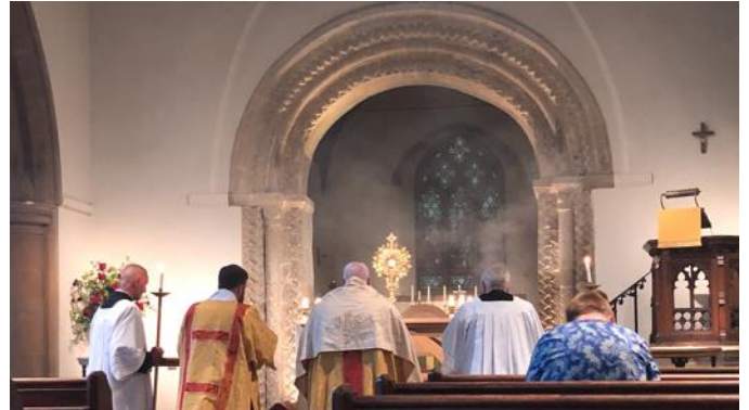
Benediction for Corpus Christi at St Andrew's

At the heart of our community is our commitment to worship God through the sacrament, prayer, and music. Our worship is centred on the Eucharist and the Daily Offices, which are kept throughout the week. The beauty of our sacramental worship seeks to reflect the overwhelming beauty of God's love for us, and to bring God's holiness into our midst.