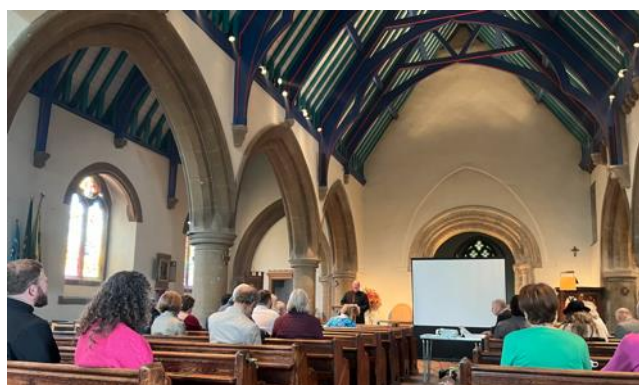
APCM at St Andrew's

St Andrew's has an engaged and committed PCC whose membership incorporates a