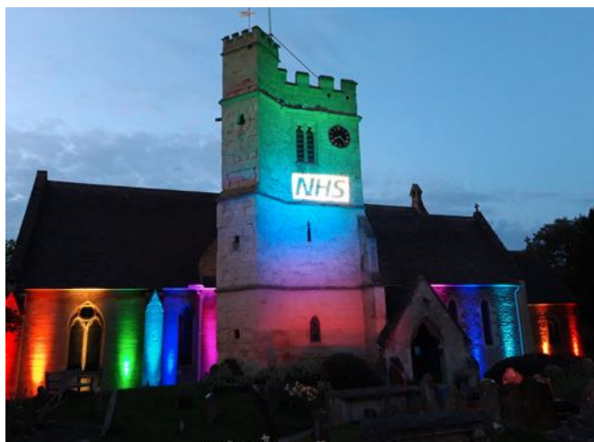
St Andrew's Church as a beacon of hope during the Covid-19 Pandemic

The story of St Andrew's throughout its history is one of hospitality and service within the Headington community. We are proud that our doors are open all day, every day and that people come in from the local community as well as the John Radcliffe Hospital to sit in prayer, light a candle, and find a place of peace. During the height of the COVID-19 pandemic, we ensured that daily mass was said and prepared weekly prayer guides for all and lectionary-based activity packs for our young people. A parishioner who works for a lighting company lit up the church throughout the lockdown making it a beacon of hope and prayer, visible from the windows of the JR Hospital and to the local community on their daily walk. With all safety precautions and risk assessments in place, we were the first church in the Deanery to open its doors for prayer on 5 July 2020.