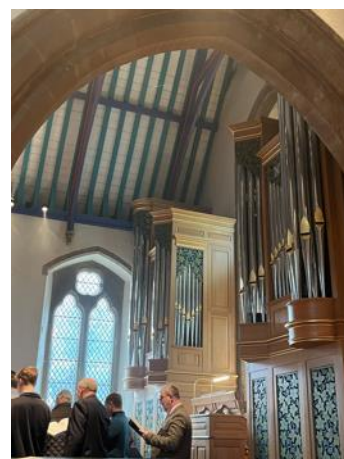
The back of our choir and our organ