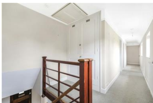
Upstairs in the Vicarage

The accommodation consists of 2 reception rooms, 5 bedrooms and 2 bathrooms (with two additional WC). It benefits from off-road parking for one car, a small garage, a separately accessible study with a WC, a utility room, and a large rear garden.