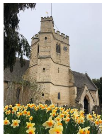
Some of the 1000s of daffodils in the Churchyard

Under our previous incumbent a major conservation project to the tower masonry was carried out in the summer and autumn of 2015. The work received a conservation award from Oxford Preservation Trust in 2016.