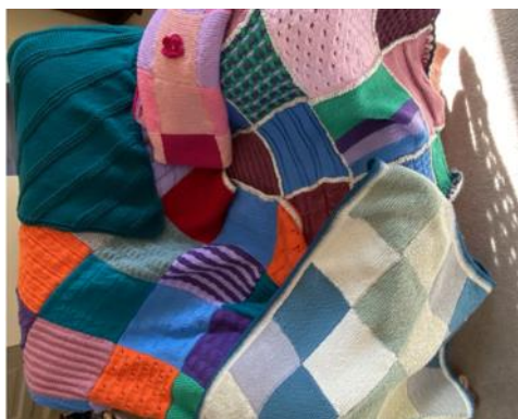
Knit & Natter Donations to the Oxford Night Shelter

This friendly community group was established in 2021 and meets in the church room for tea and cake every other Monday, apart from bank holidays. We welcome all levels of knitters and crocheters and all other crafts, and numbers of attendees are currently 12-18. We are happy to show people how to knit or crochet, or to help out if we can with any questions. In the spirit of TOM, non-knitters are also welcome to come along for a chat and to meet others in a relaxed atmosphere – we cater for all ages and have plenty of toys for our youngest members.