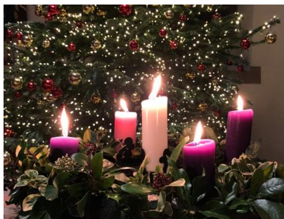
Christmas at St Andrew's