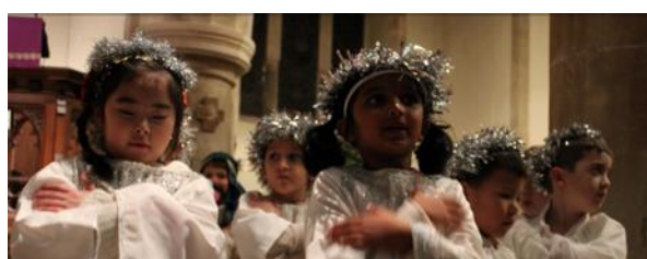
St Andrew's School at the Church

backgrounds with more than 45 first languages spoken across the student body. The