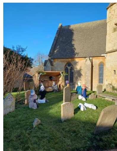
Children's Christmas Stable

Our Young Church community (parents and carers) take part in the opening procession at each Eucharist. This ensures that the children feel welcomed at the heart of our sacramental worship. Following Christ, who said, “Let the little children come to me, and do not hinder them, for the kingdom of heaven belongs to such as these,” we seek to make the altar and sanctuary approachable, open-armed