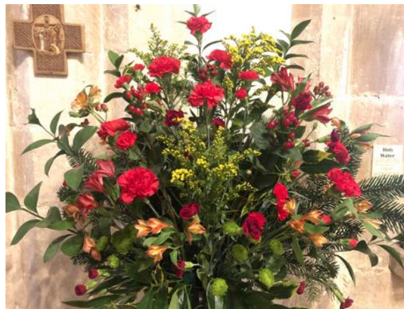
Sunday Flowers at St Andrew's