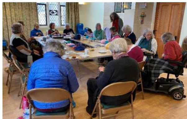
Tea on Monday and Knit & Natter

The group also makes items for charity, and this extends beyond the meeting times with a 'Knit and Natter' box in church where any members of the community can collect wool and deliver their squares to be assembled into blankets for local organisations. The group also knits hats, gloves and scarves for the Mission to Seafarers and at Christmas time we make gifts for the 'St Andrew's Boat' to be distributed by the Salvation Army to those in need. We also support church projects such as knitted sheep for baptismal gifts and in 2024 we made poppies for the Remembrance display.