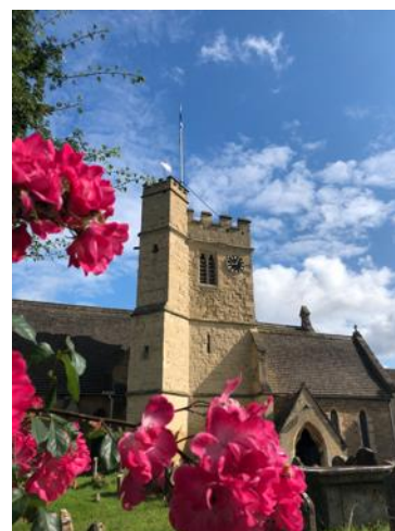
St Andrew's in the Spring

Although the site as a place of worship is thought to pre-date the reference to the church in the royal charter of Henry I, St Andrew's Church is of Norman origin with subsequent additions throughout the centuries until the present day. It is a listed grade 2 star church building within the Headington conservation area.