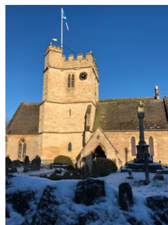
St Andrew's in the Snow

The church building has proved ideal for concerts. Prior to the Covid pandemic, regular recitals were organised, with visiting musicians being a popular and regular feature of our musical life, and we would welcome the opportunity to start these recitals again.