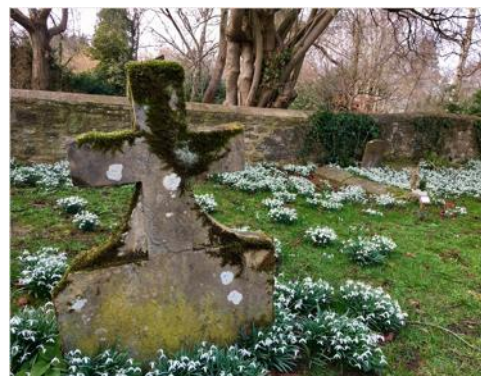
Snowdrops in our Churchyard