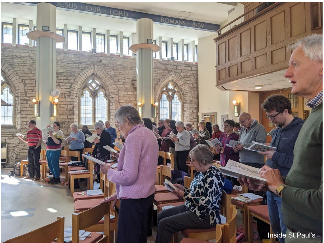
Inside St Paul's