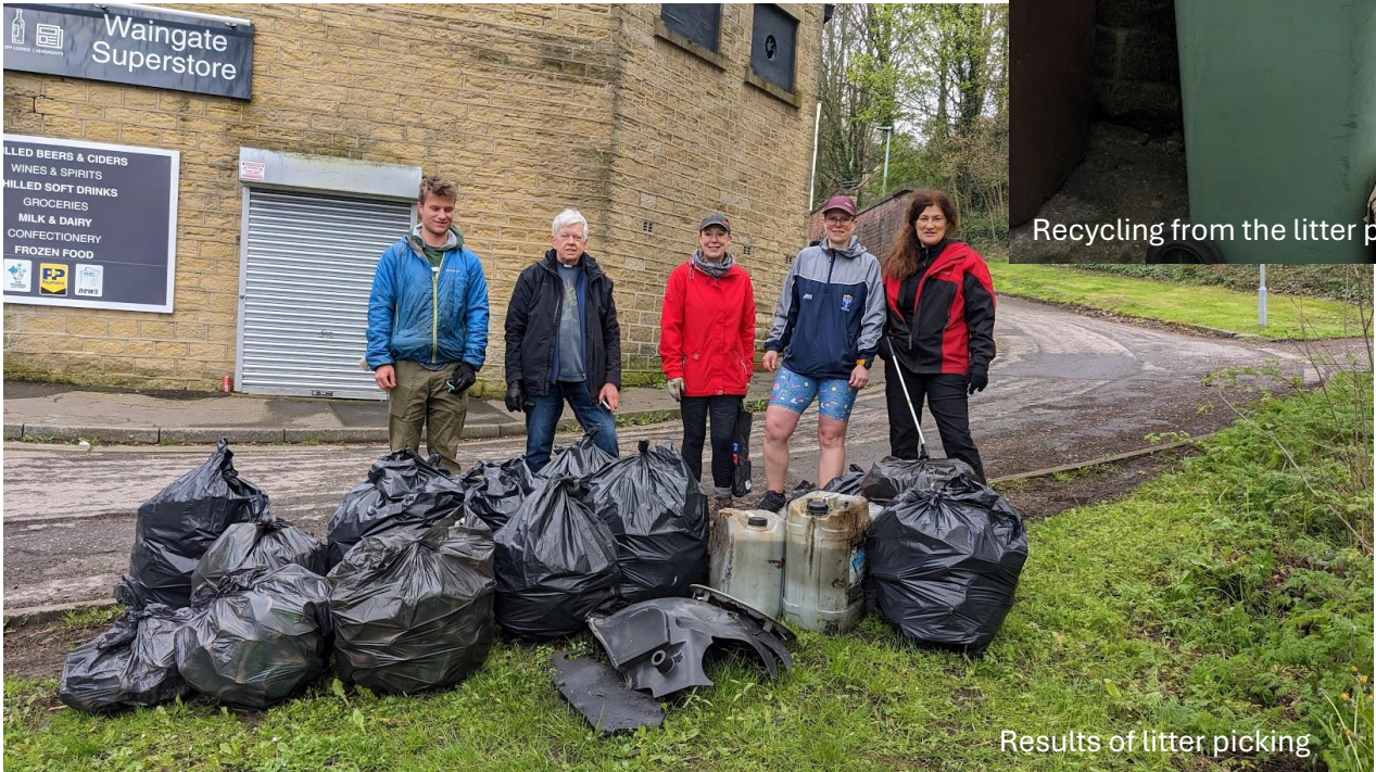
Results of litter picking