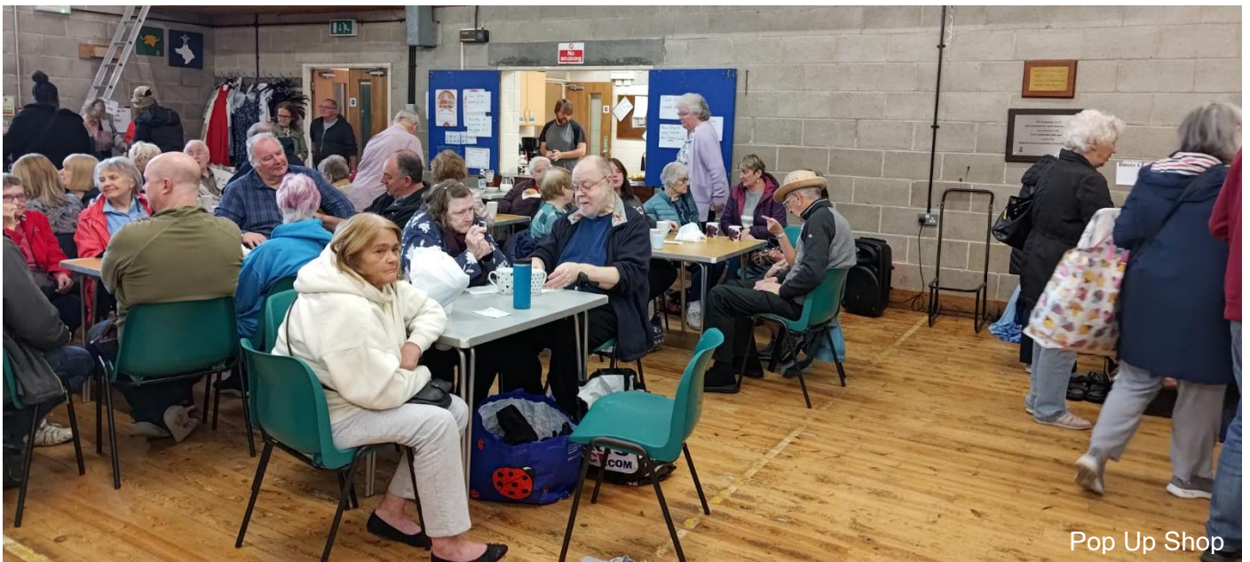
Pop Up Shop