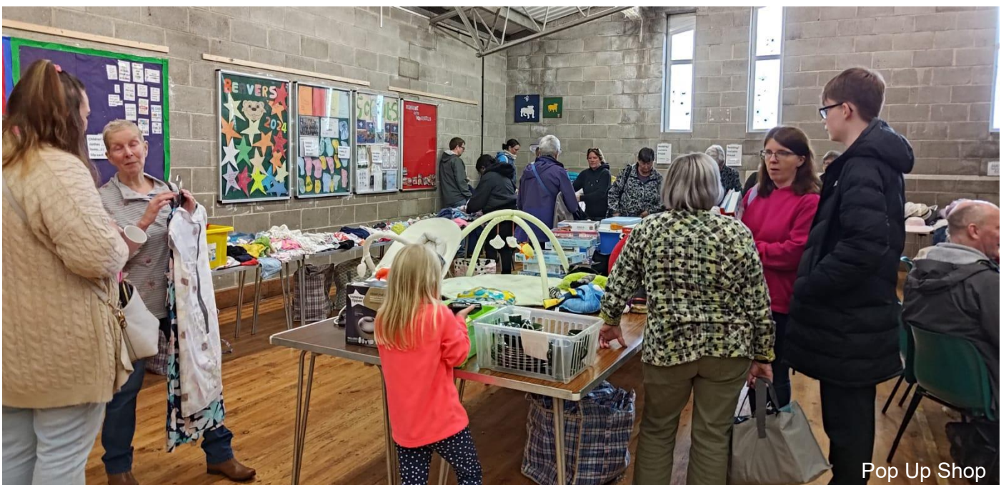
Pop Up Shop