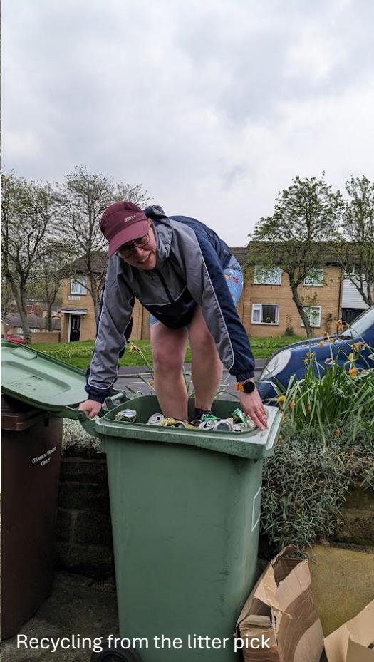
Recycling from the litter pick