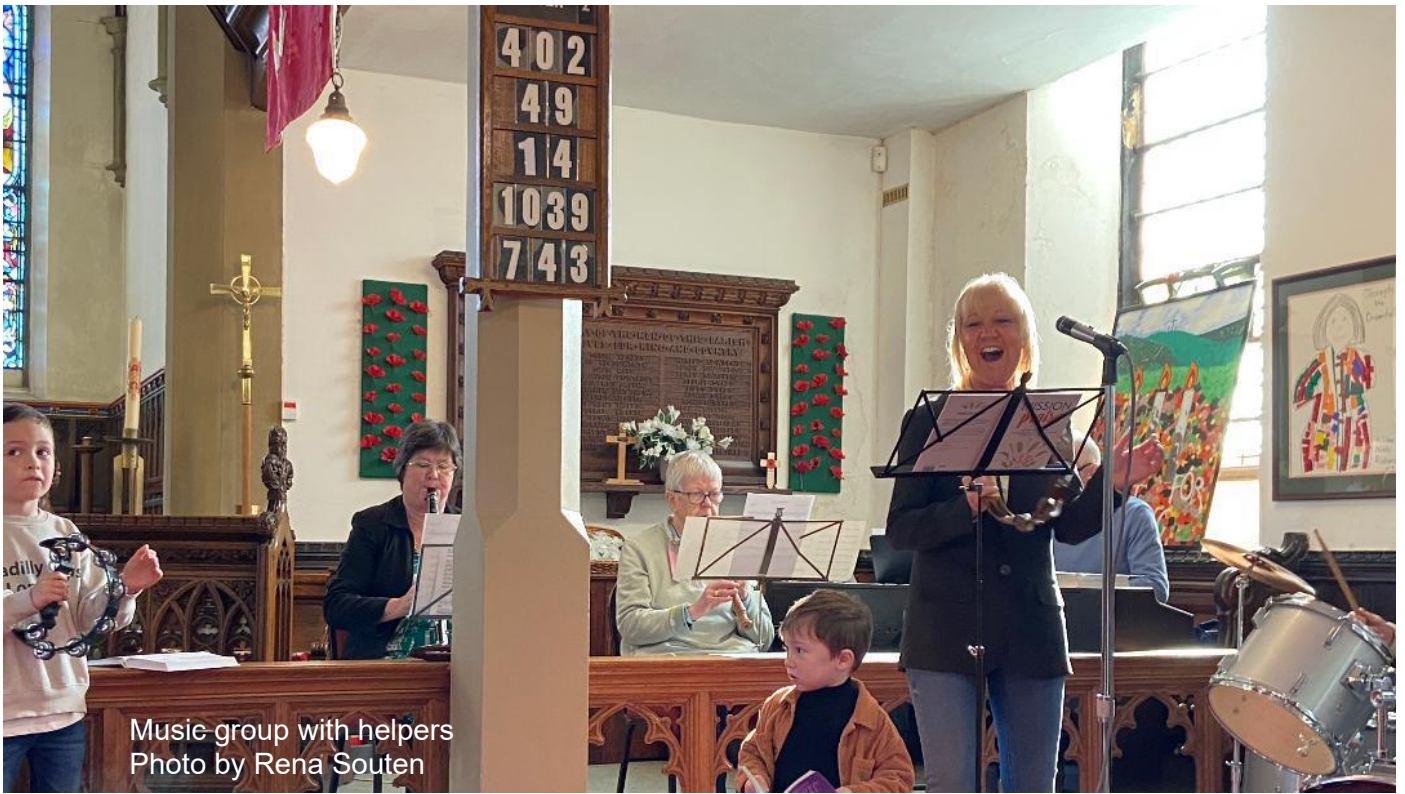
Music group with helpers