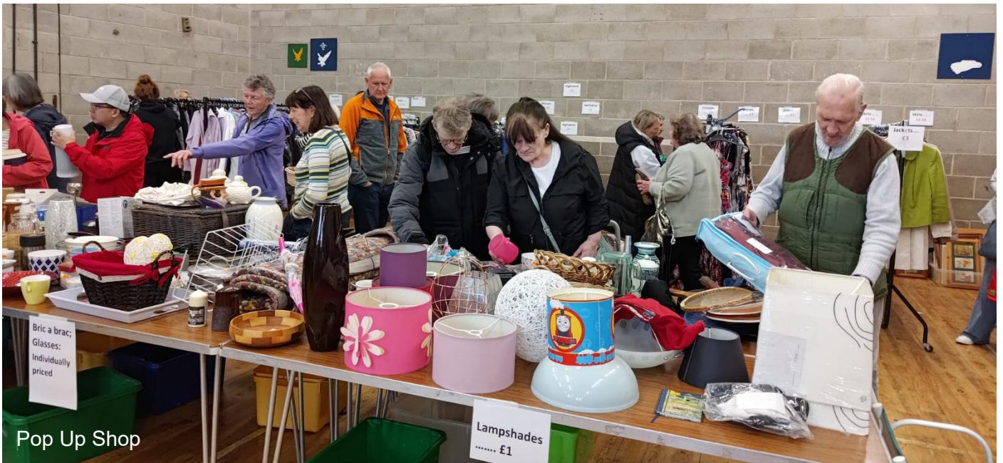
Pop Up Shop