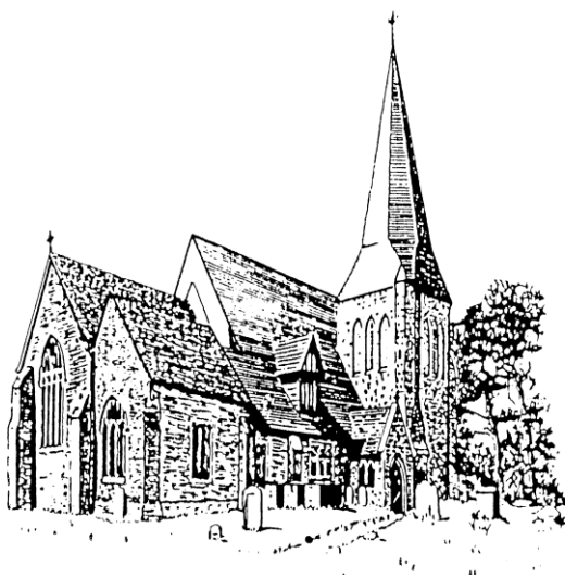
All Saints, Herstmonceux

A profile of the priest we are looking for is included as a separate section at the end of this document. We seek someone to lead us joyfully in proclaiming the gospel in our communities, living out God's love in our parishes. We are keen to welcome and support new leadership, and innovations that will encourage sustained growth in our congregations.