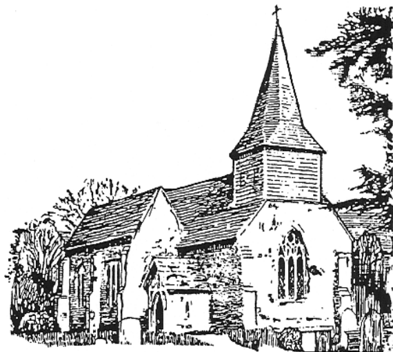
St Mary Magdalene, Wartling