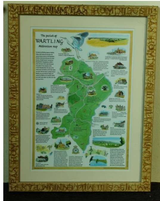
Millennium Maps: Herstmonceux and Wartling