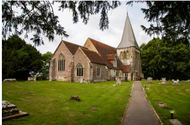
All Saints, Herstmonceux

The buildings and churchyards are generally well maintained and received reasonable quinquennial reports from the supervising architect in 2022 but, inevitably with such old buildings, the reports also identified features which need attention within the next few years. Copies of the Church Guides are available on request.