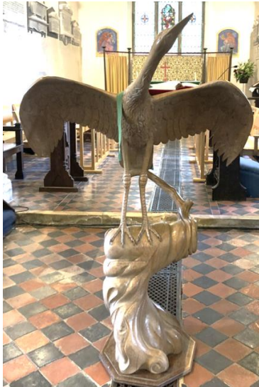
The Heron at Wartling