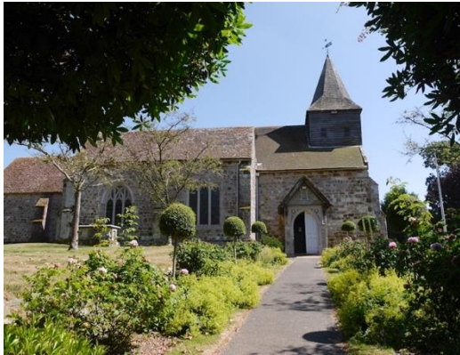
St Mary Magdalene, Wartling

The two Grade 1 listed historic churches (the current building at All Saints, Herstmonceux dates from 1180AD; St Mary Magdalene, Wartling dates from 1260AD) are 2½ & 3½ miles respectively from the Rectory. The churches are steeped in the spiritual peace that comes from centuries of prayer and worship. St Mary Magdalene is in excellent order - recent developments there have included rewiring and installation of a toilet & kettle point. The church has a Silver environmental award from A-Rocha. All Saints has benefitted from installation of a toilet and kettle point, and of an area of flexible seating at the rear of the church, which is particularly useful as there are no separate church halls. All Saints has recently registered with A-Rocha, with a view to achieving an environmental award. The Friends of All Saints, a charity, contributes funds towards restoration and preservation of the church building. Active steps are being taken to tackle long-standing damp at All Saints as well as a wider renovation project.