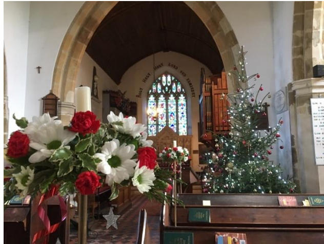
Christmas at All Saints

The Rectory in West End, Herstmonceux, is modern, well-appointed and ideal for family occupancy. It has a double garage, and is a few minutes' walk from the centre of the village and its primary school. It has 4 good-sized bedrooms (one with a handbasin in the room) and a bathroom (with both bath & shower) upstairs; a large dual aspect dining/living room, a sitting room, a fitted kitchen, a separate utility room, and a toilet/shower room downstairs. The large study/parish office, which is spacious enough to use for PCC and other meetings, has a door into the larger reception room as well as a separate entrance direct from the driveway, and French doors into the garden. The garden of about ½ an acre includes a greenhouse and two garden sheds, some established fruit trees, currant bushes etc.