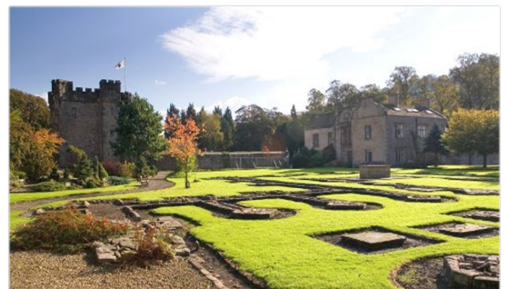
Whalley Abbey Centre for Christian Discipleship and Prayer