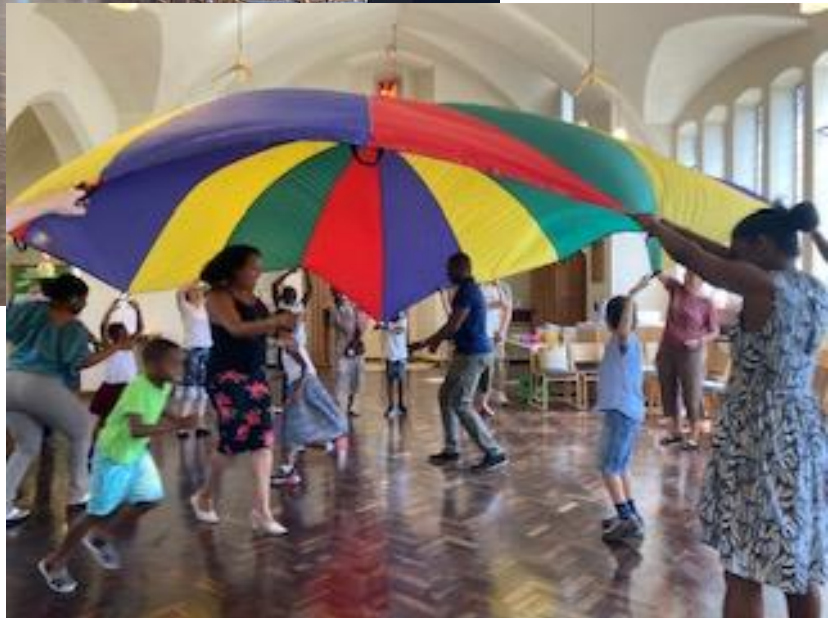
Right – Junior Church Summer Party in 2022 in the cool of the church when the outside temperature was 35 o +C

The next phase is the construction of an Annexe to the northside of the church which will provide an accessible toilet, high-quality kitchenette with a new meeting space for medium sized groups. This will also include accessibility enhancements to the church and refurbishment of outdated facilities. This project has been in development for several years with input from our Eco Group to ensure it has fully considered sustainability. Planning permission was granted in October 2023 with a view to construction in 2024. Funding, which is expected to be sufficient, has been ringfenced for construction.