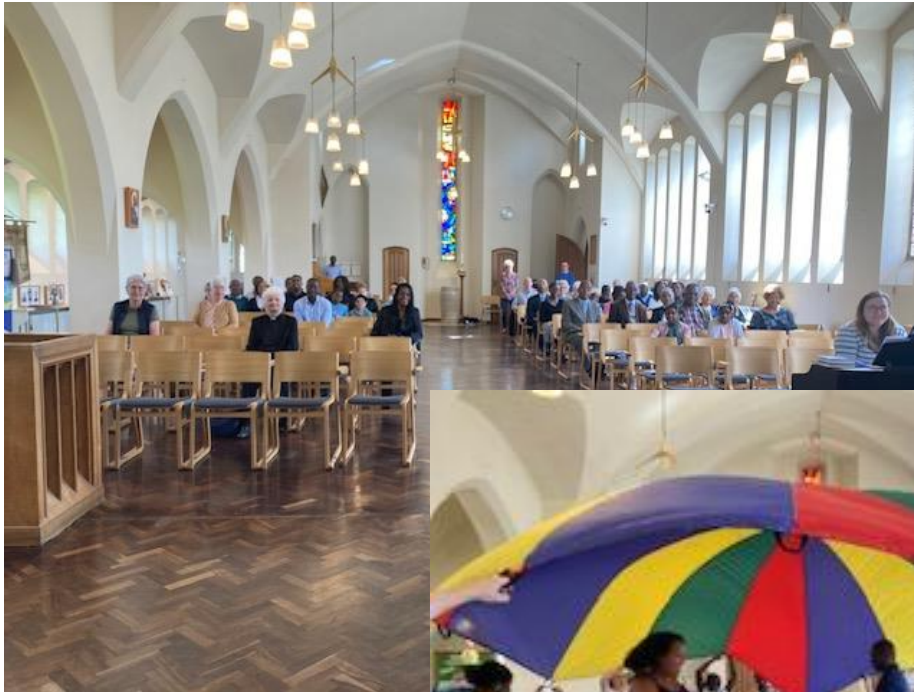
Above – Sunday Eucharist

A recent reordering in the church has replaced the original pews with chairs making the church a flexible large space that can adapt to changing needs.