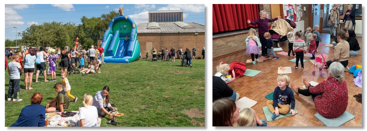
Families enjoy a Fun Day at the Church ...