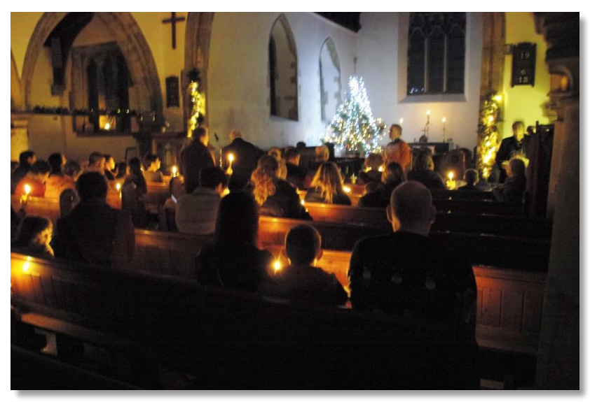
Carols by Candlelight is a popular Christmas service.