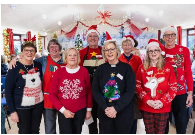
Some church members and helpers prepare to serve lunch in the December Pop-Up Café