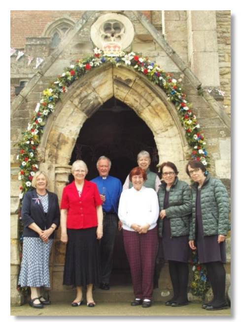
Some members of the Flower Arranging Team under their Coronation Arch

This is mainly confined to the village of Wawne and the immediate area. There are strong links with the village Primary School, which is a state school, not maintained by the Church of England. Assemblies were taken regularly by the retiring incumbent and occasionally by our Licensed Lay