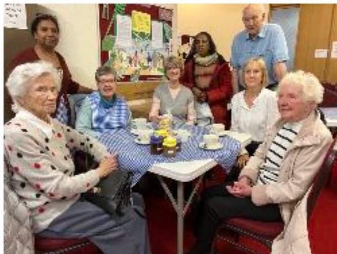
Coffee morning visitors and helpers

A church Coffee Morning , open to all, is held on the 3rd Saturday of the month, providing regular fund-raising support. Prior to the pandemic, various other fund-raising events took place across each year. It has proved difficult to regain momentum over the past 18 months but we intend to reconvene our Social Committee in the near future.