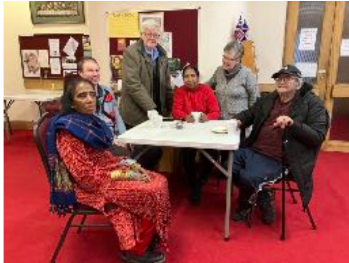
'Warm Hub' over the winter months

Other groups regularly using the community room include the 'Bread of Life' soup kitchen, a 'members only' Craft group, and a Whist group. From November to the end of March for the past 2 years we have hosted a weekly 'Warm Hub' in the community room, offering a safe, warm space with light refreshments free of charge, social companionship and signposting to local services as appropriate.