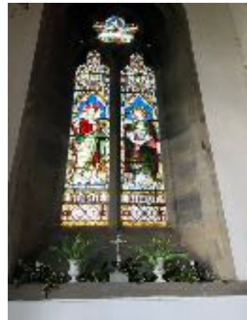
Lady Chapel Window