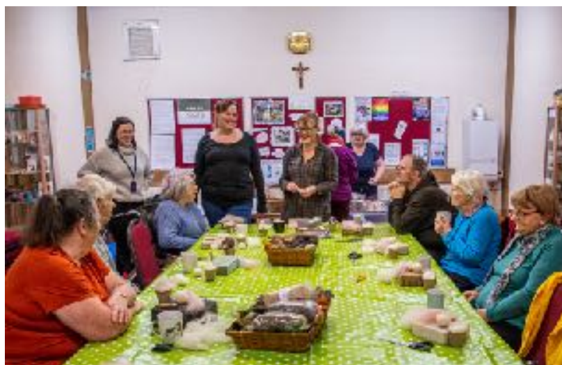
St John's Aspire members

Aspire Creating Communities is a network of community groups across Kirklees aiming to combat social isolation and loneliness experienced by older people which began at St John's in 2015 as our community project, enabling us to secure Heritage Lottery funding for restoration work. The St. John's group continues to meet weekly in the community room, offering a range of activities, including for example, crafts, speakers, exercise, music and inter-generational engagement. An Aspire group is also established at Birkby Croft, a sheltered housing complex within the parish.