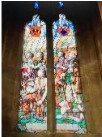
Part of the West Window