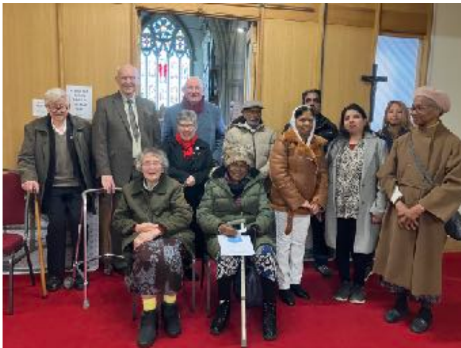
Members of the congregation including some PCC members

Our multi-ethnic congregation (Afro-Caribbean, South Asian, White British), is relatively small, averaging a total of approximately 25-30 persons at Sunday morning services (including children). Ages and gender are mixed, with some older, retired persons, some working people and some younger families with children.