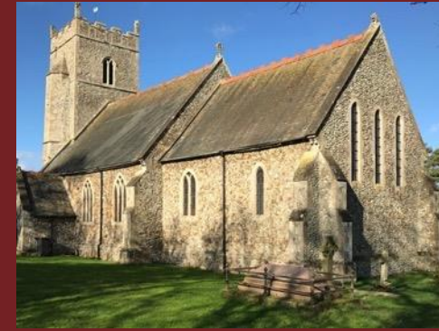
All Saints, Boughton