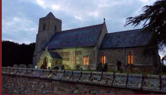
St. Andrew's, Barton Bendish