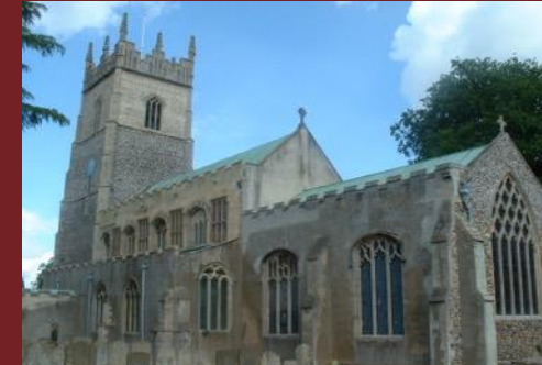
St. Andrew's, Northwold