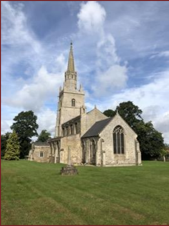
St. George's, Methwold