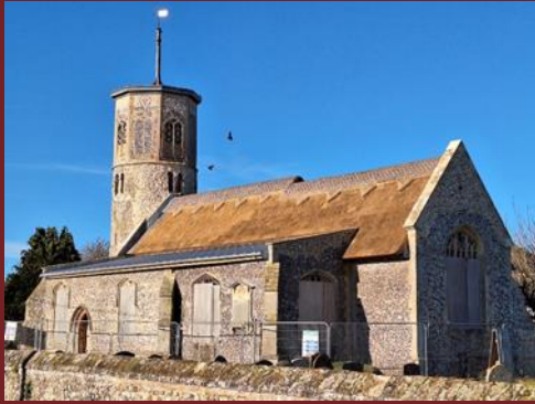
St. Mary's, Beachamwell