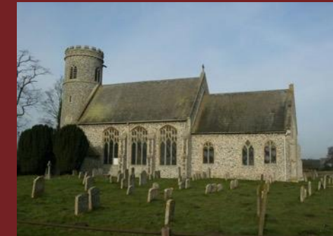
St. Mary's Weeting