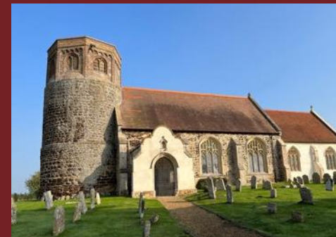
St. Andrew's, West Dereham