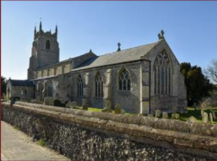
St. Mary's, Feltwell