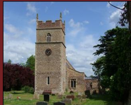
All Saints' Wretton with Stoke Ferry