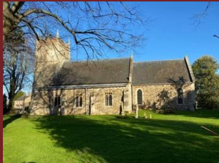
St. Margaret's, Wereham