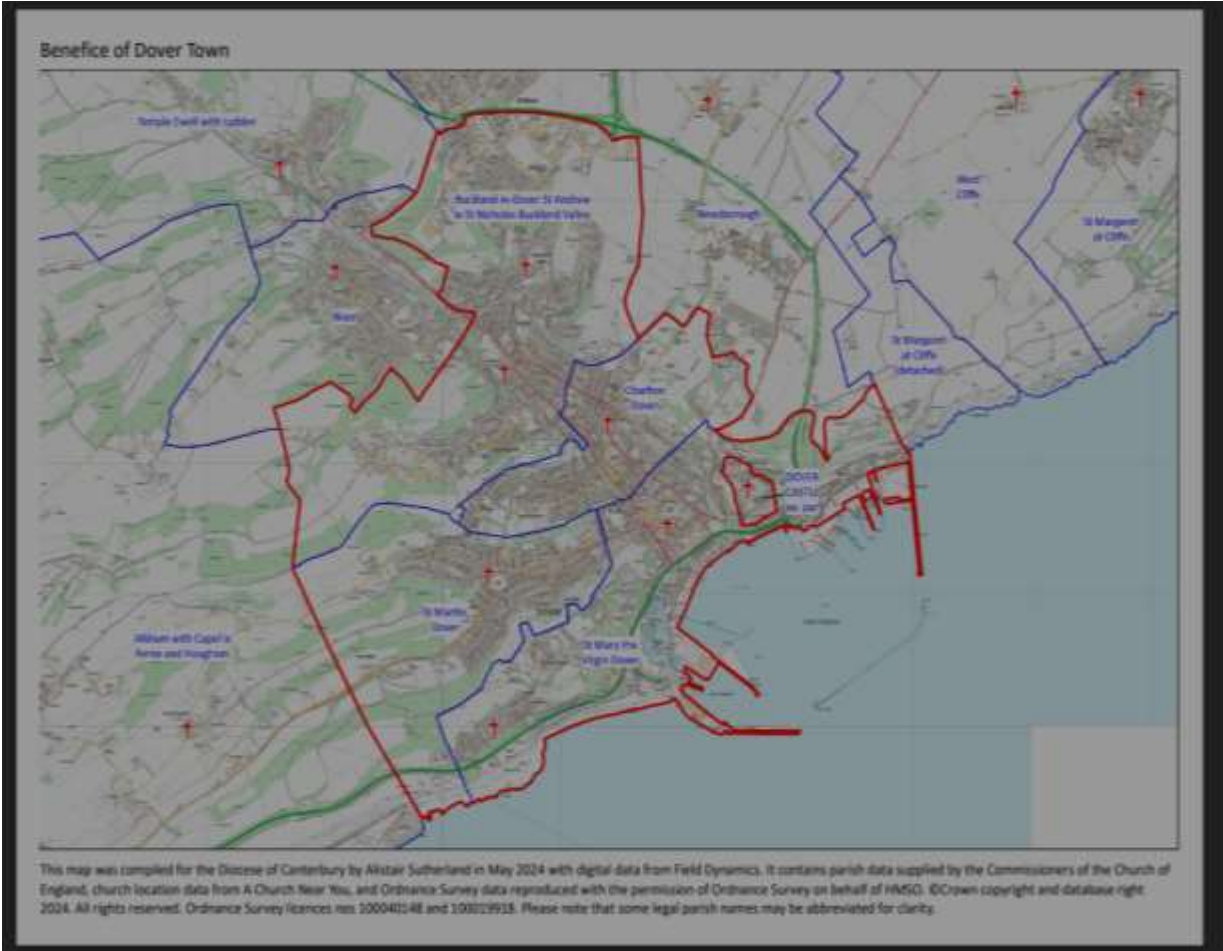
The map depicts the area covered by our parishes.