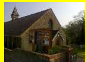
St Martin Dover