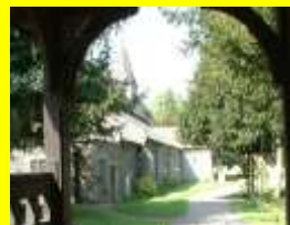
St Andrew Buckland