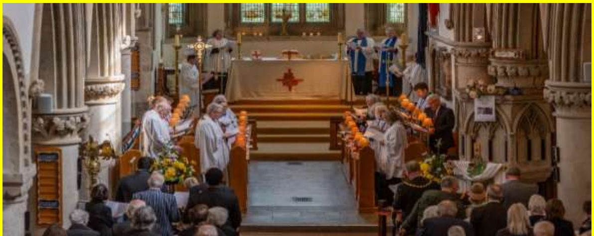
Some of our Churches