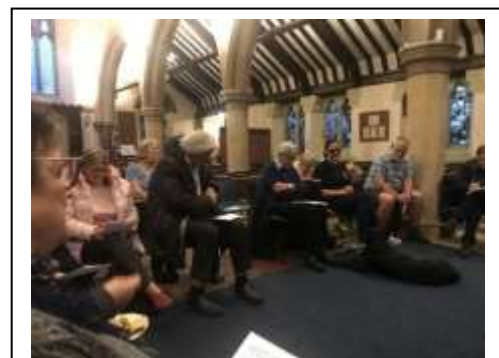
A recent meeting of the Benefice Forum at St Andrew's