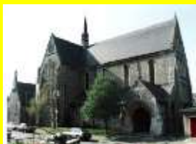
St Peter & St Paul Charlton