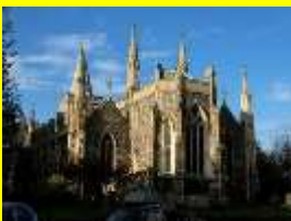
St Mary the Virgin Dover