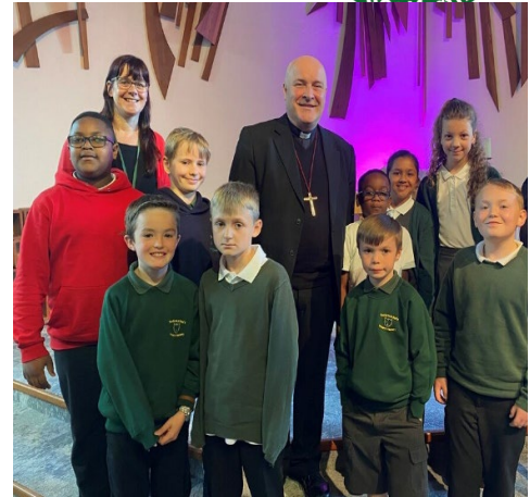
The Worship Team at the Diversity Conference

“The school’s Christian vision nourishes and permeates all aspects of school life. Passionate and dedicated leaders, including governors, have a deeply theological understanding of the vision which shapes every decision they make. This results in a vibrant and loving community where pupils and adults flourish as part of God’s family.”