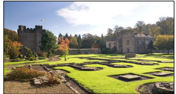
Whalley Abbey Centre for Christian Discipleship and