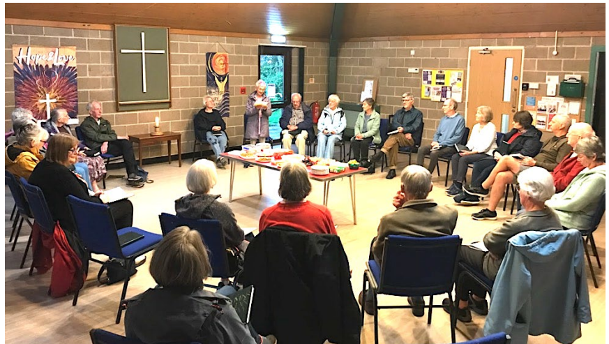
Picture at the Hala Centre of Churches Together in South Lancaster after the prayer walk.

Members of the church are active members of two ecumenical groups: South Lancaster Churches Together (which includes the local United Reformed Church, Methodist Church and Roman Catholic Church), as well as Churches Together in Lancaster. This involves shared worship (eg. Easter Sunday dawn service, prayer walks) and service (e.g. Christian Aid collections).