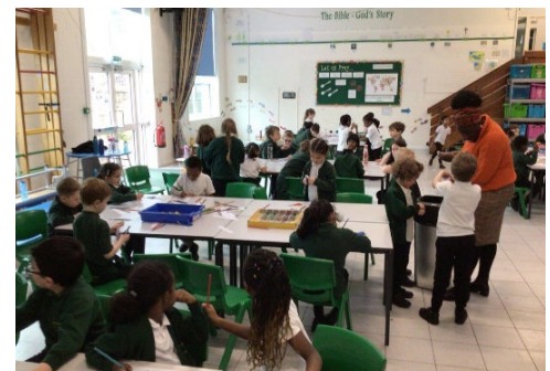
A recent Spirituality Session with Y1/2

At Scotforth St Paul's CE Primary and Nursery School, we work very closely with Scotforth St Paul's Church to deepen the children's understanding of Christianity and their spirituality. Our school has been described