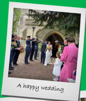
A happy wedding