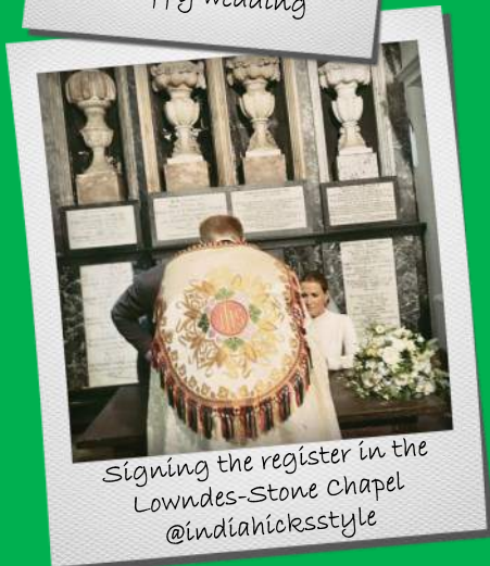
Signing the register in the Lowndes-Stone Chapel @indiahicksstyle