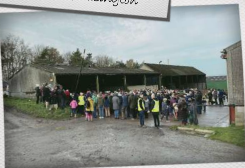
Easington Live Nativity on the farm