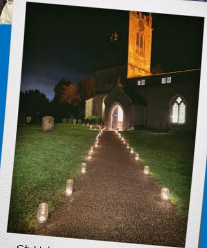
St Helen's Church ready for a carol service

The congregation in Benson is in good health, devoted to Christ and growing in his love. The past two years have seen the adoption of a new plan for congregational development, as well as the award of an EcoChurch Bronze award, the full establishment of a small pastoral care team, two Alpha Courses run ecumenically, and several Christian education courses. There is an online Contemplative Prayer Group that meets fortnightly, and congregation members staff the local Helpline, the Patients Panel, run a local community garden, and serve as Street Pastors in nearby Wallingford.