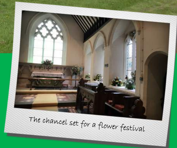
The chancel set for a flower festival

The village itself is equipped with an excellent pub, the Lord Nelson, which also serves as a produce shop for locals. With such a small community, the life of the church is well embedded within that of the village, and there is significant goodwill towards the church among residents which shows itself each year at the annual Lent Lunch, Remembrance Sunday, and Advent and Christmas carol services.