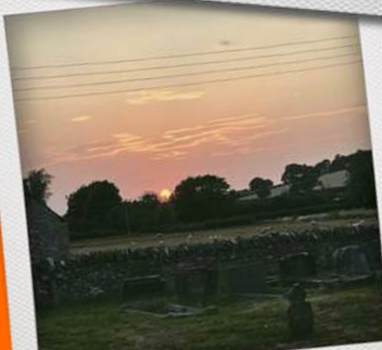
Sunset over Cuxham churchyard