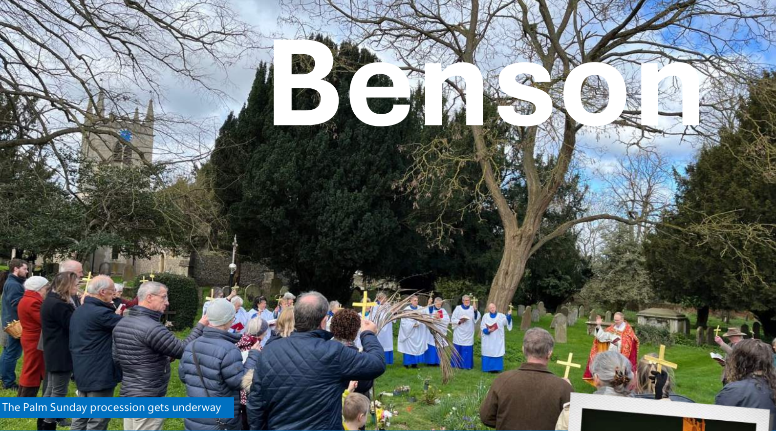
The Palm Sunday procession gets underway

St Helen's Church serves a population of around 4,600. Congregation numbers (roughly 50 adults and children on a Sunday morning) and income are stable, thanks to recent mission work. Growth has occurred through 4 O'Clock Church, a family service held monthly at 4pm; as well as the weekly service in the new nursing home; and recruitment to the parish choir, which sings an anthem every Sunday and helps lead the congregational mass setting. Worship is loosely modern Catholic in style: vestments are worn and the sacrament is reserved, but the atmosphere remains relaxed.