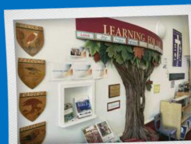
Prayer corner at Benson CofE Primary School