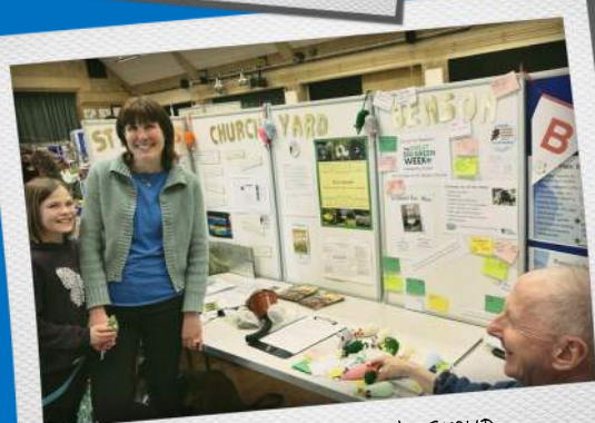
St Helen's EcoChurch Group at a local Big Green event