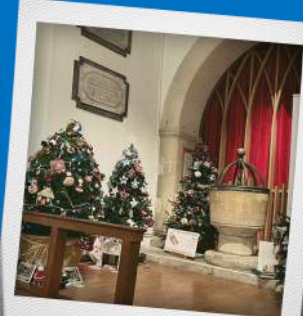
Christmas tree festival