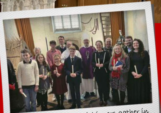
Newly-confirmed parishioners gather in front of the bell-tower with the Bishop

The church of St Mary the Virgin was rebuilt in 1430-50 by William and Alice de la Pole, Duke and Duchess of Suffolk, who as part of their devotion to Christ also founded the adjacent almshouses and school. Their practical devotion to Jesus continues to inspire the present-day congregation, whilst the history of Ewelme's buildings and their stories attract visitors from far and wide.