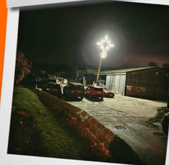
Follow the star!