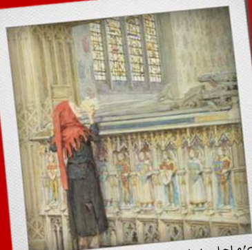
Eleanor Fortescue-Brickdale's painting of Alice's tomb

A major part of the next Associate Priest's role will be to lead us in growing fresh service patterns, with the aim of developing new congregations. The PCC is looking at introducing two different monthly services—an evensong and an afternoon children's service—and has set aside substantial funds for such work.