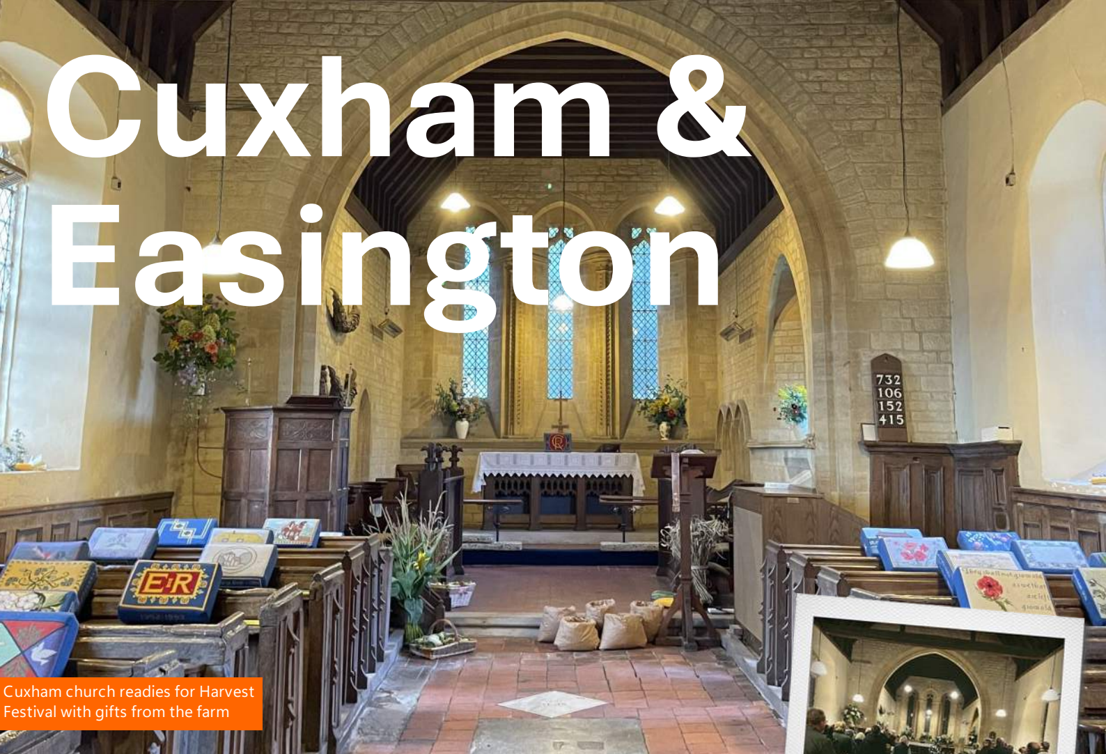
Cuxham church readies for Harvest Festival with gifts from the farm

Cuxham is a rural farming village, with a population of about 140. The Church of the Holy Rood stands by Manor Farm, and the monthly congregation for the Family Communion service averages about 15-20, including a few children who help to lead. The village is deeply connected to the church, with special services for Harvest, Remembrance Sunday, and Christmas sometimes exceeding the church's capacity. The community in Cuxham is exceptional—there is a deliberate network of care and friendship that is cultivated by villagers of all ages, and which serves as a pastoral care 'net'.