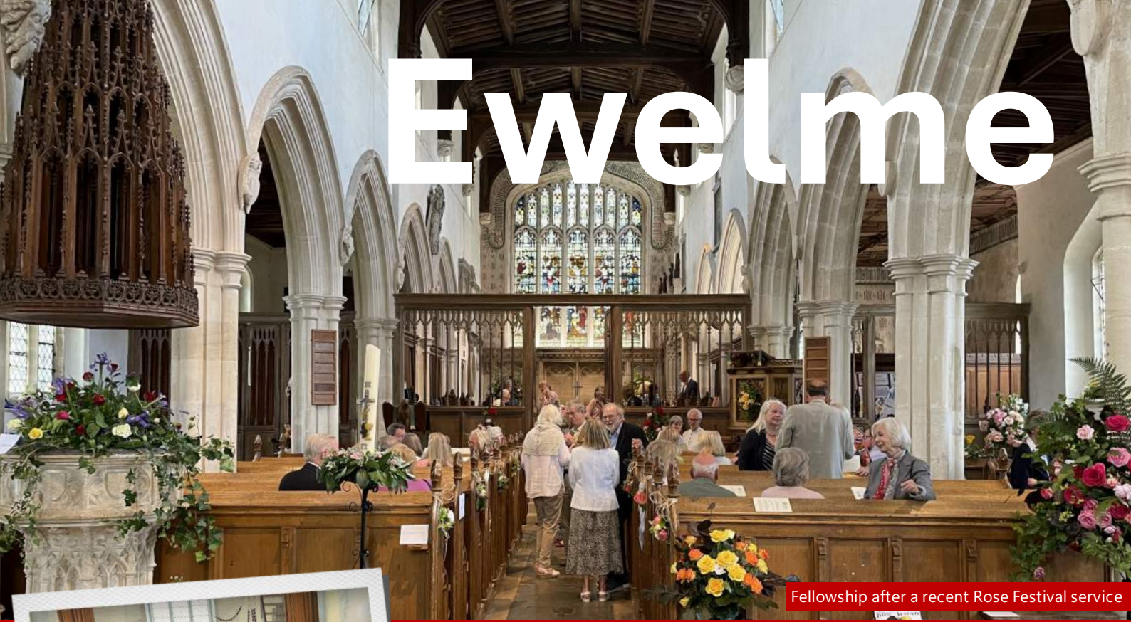
Fellowship after a recent Rose Festival service