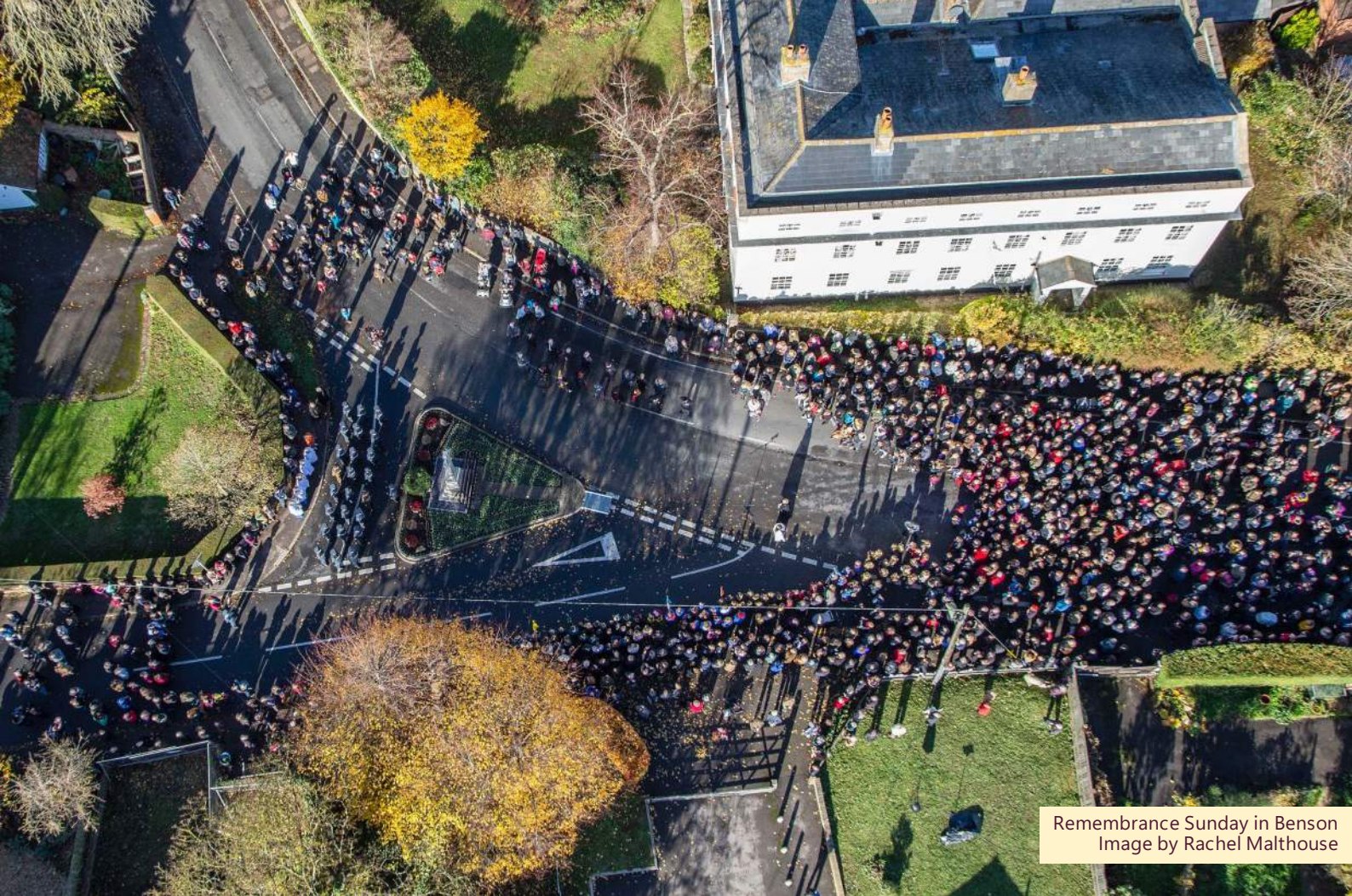
Remembrance Sunday in Benson