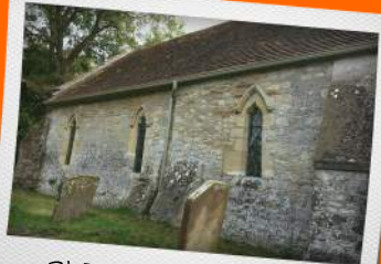
St Peter's, Easington

Cuxham is a rural farming village, with a population of about 140. The Church of the Holy Rood stands by Manor Farm, and the monthly congregation for the Family Communion service averages about 15-20, including a few children who help to lead. The village is deeply connected to the church, with special services for Harvest, Remembrance Sunday, and Christmas sometimes exceeding the church's capacity. The community in Cuxham is exceptional—there is a deliberate network of care and friendship that is cultivated by villagers of all ages, and which serves as a pastoral care 'net'.