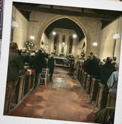
Cuxham Church full for Christmas Carols

congregation at the monthly BCP Communion service numbers 10-15, but special services can attract congregations of up to 40, thanks to the commitment of the farm family, who look after and vigorously promote the church's activities.