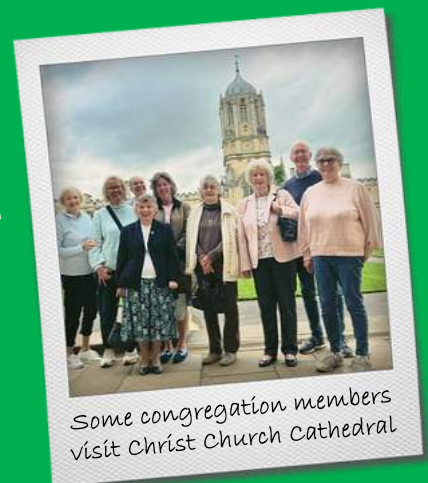
Some congregation members visit Christ Church Cathedral