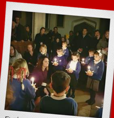
Ewelme School Christingle in St Mary's Church

The church of St Mary the Virgin was rebuilt in 1430-50 by William and Alice de la Pole, Duke and Duchess of Suffolk, who as part of their devotion to Christ also founded the adjacent almshouses and school. Their practical devotion to Jesus continues to inspire the present-day congregation, whilst the history of Ewelme's buildings and their stories attract visitors from far and wide.