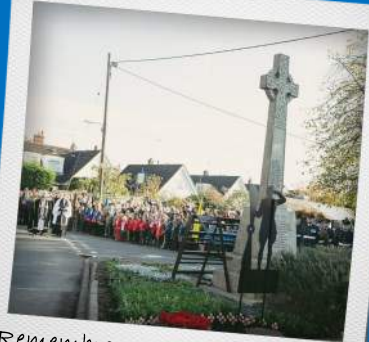
Remembrance Sunday flypast at the War Memorial