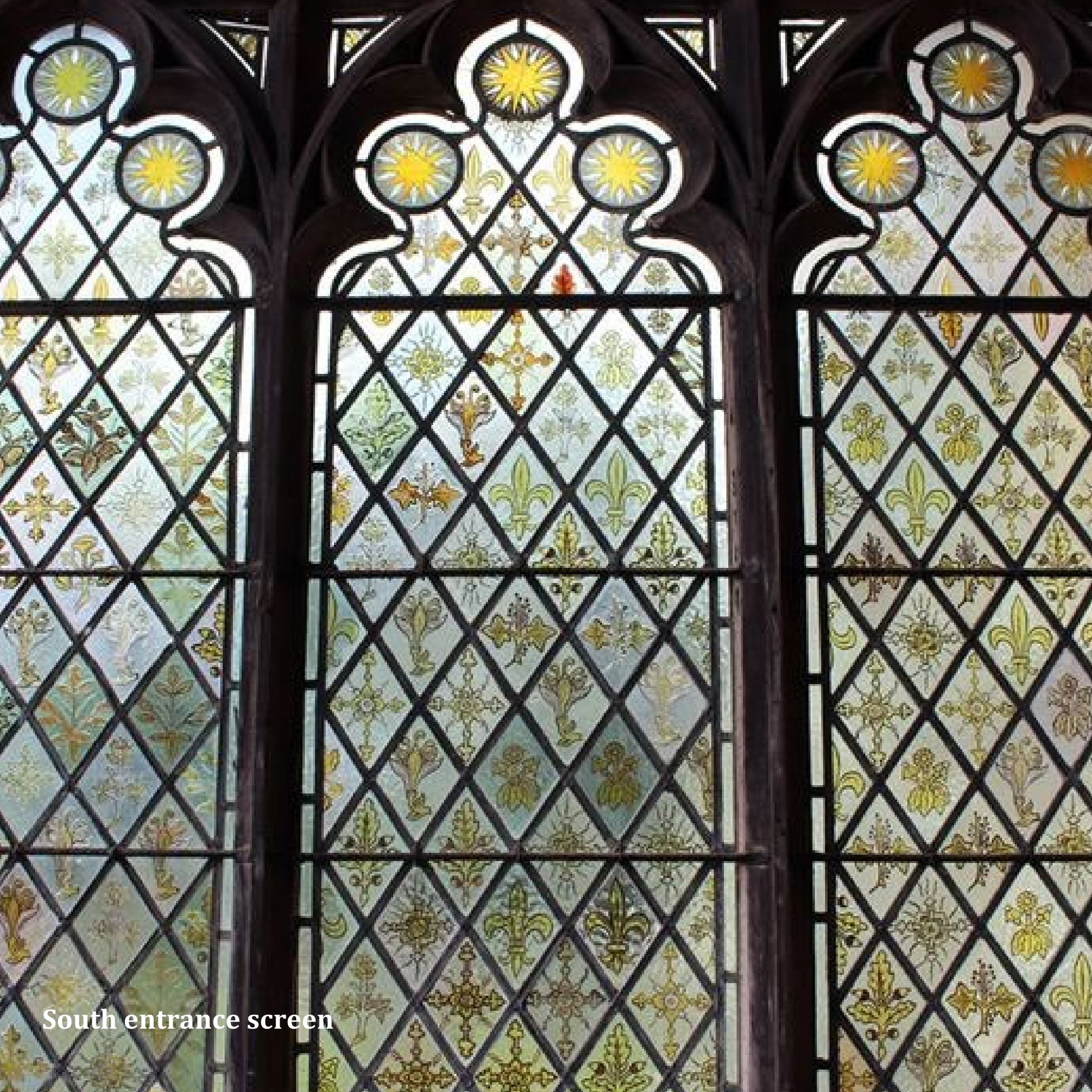
South entrance screen