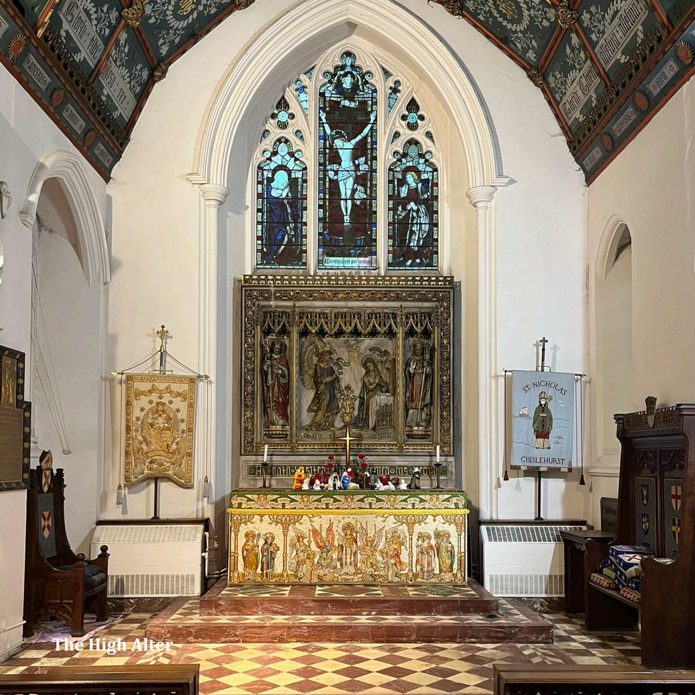
The High Altar