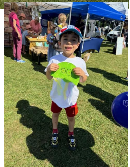
Feast of St Peter on the Common