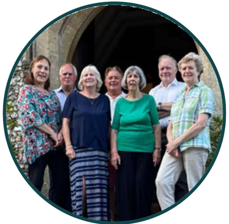
Our Churchwardens, who enjoy both parish and social engagements together.

Our Ministry Team members are very supportive of each other and the Benefice parishes. Their dedication and commitment in working alongside the Parish Administrator and Churchwardens who have stepped up into leadership roles, have enabled the churches to work more cohesively in a very positive setting.