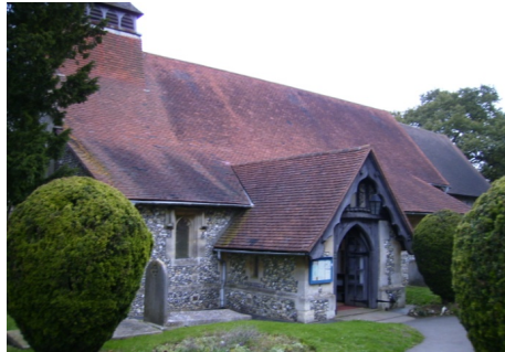
All Saints' Warlingham