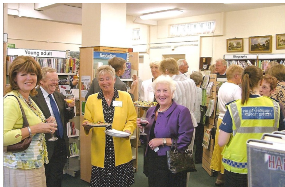
Friends of All Saints'

All Saints' has been focussing on ways to increase its community engagement and commenced a weekly Scrabble group and a Community Choir - both of which have been popular. Messy Church commenced last year, alternating months with St Christopher's Messy Church, this has drawn in many families who come regularly.