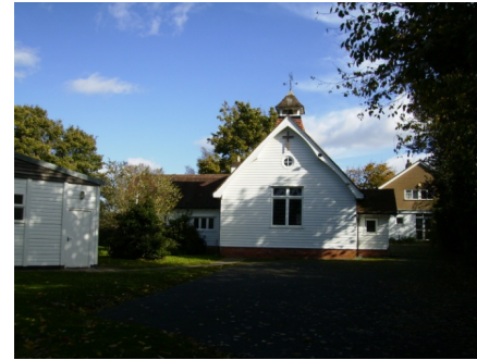
St Christopher's Warlingham