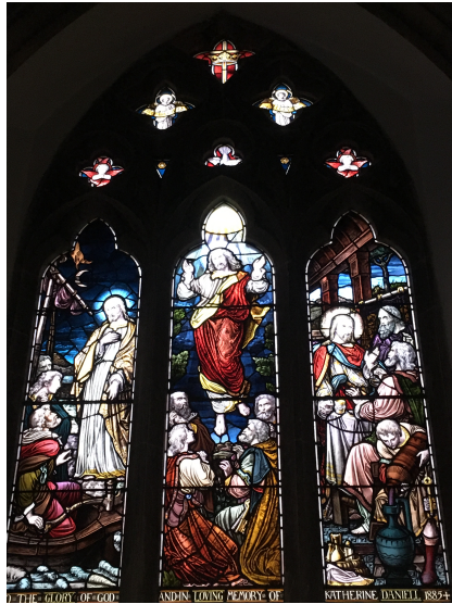
The Ascension Window

and which has held an annual fundraising concert often with world-class musicians. An Animal Blessing Service and Dog show has been held annually by way of fund raising and outreach. This is a highly successful and enjoyable event held in the churchyard.