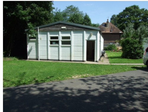
Chelsham Road Community Hall adjacent to the church

Chelsham Road Community Hall, which is owned by the church, is situated next to the church. It is well equipped with a kitchen and used for groups such as the Brownies and Guides and to host the Advent Lunch for older people. It is hired out to a variety of regular users, such as Pilates, Tai Chi, Alcoholics Anonymous and is also available for private hire. It is a valuable source of income to the church as well as being a community resource.