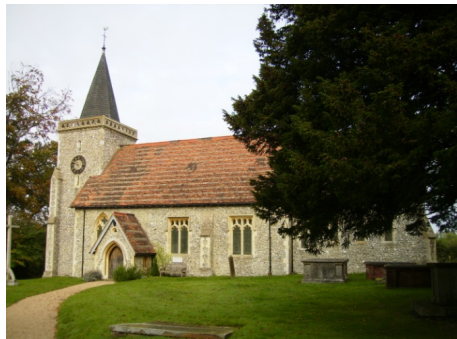
St Leonard's Chelsham