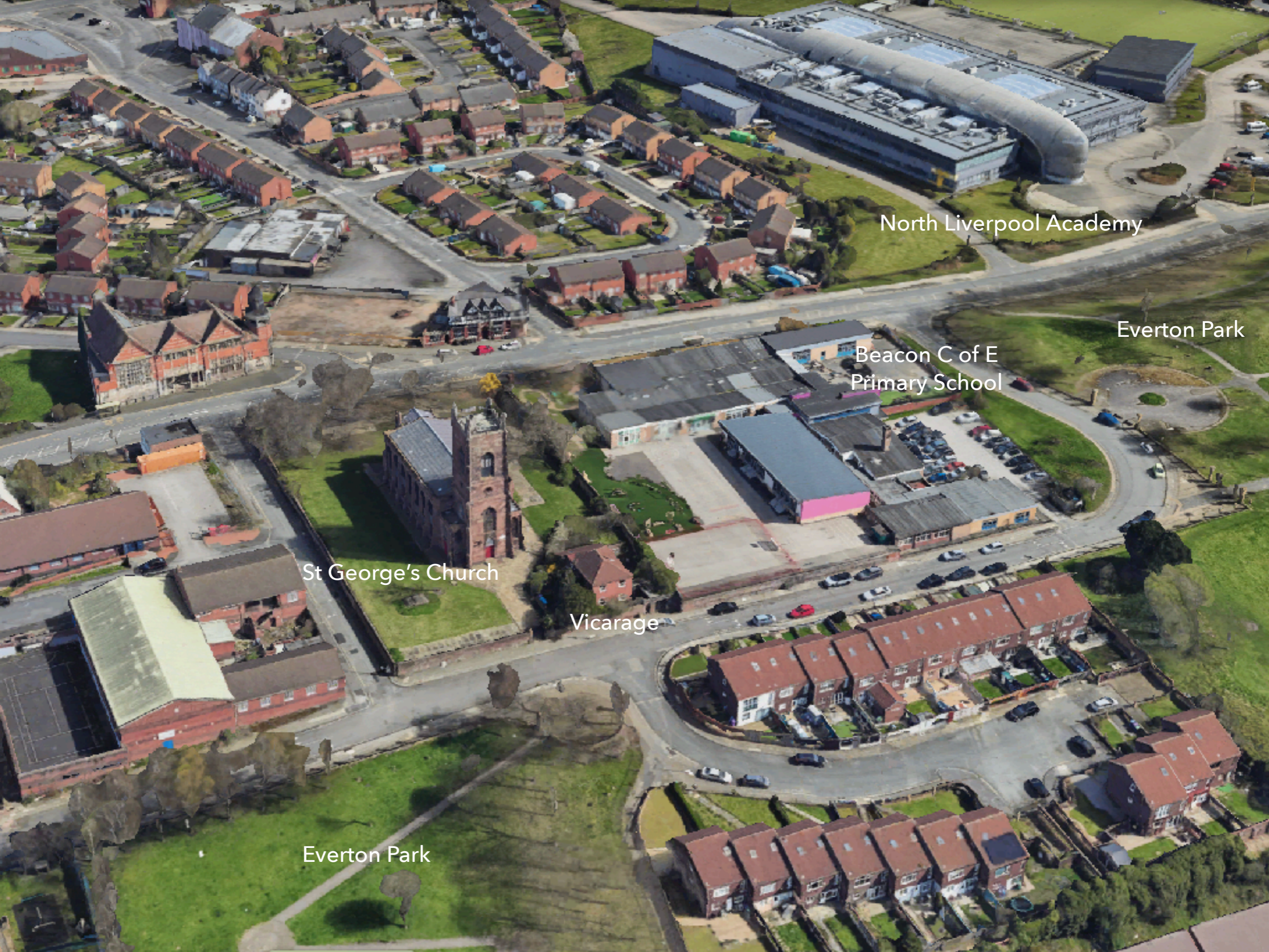
North Liverpool Academy