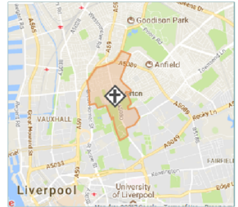
The Parish covers North Everton ward and parts of the Vauxhall wards here .

Community based voluntary organisation that provides practical help, advice, support and training with a Centre home to a number of organisations that provide help and support to local residents. Here .