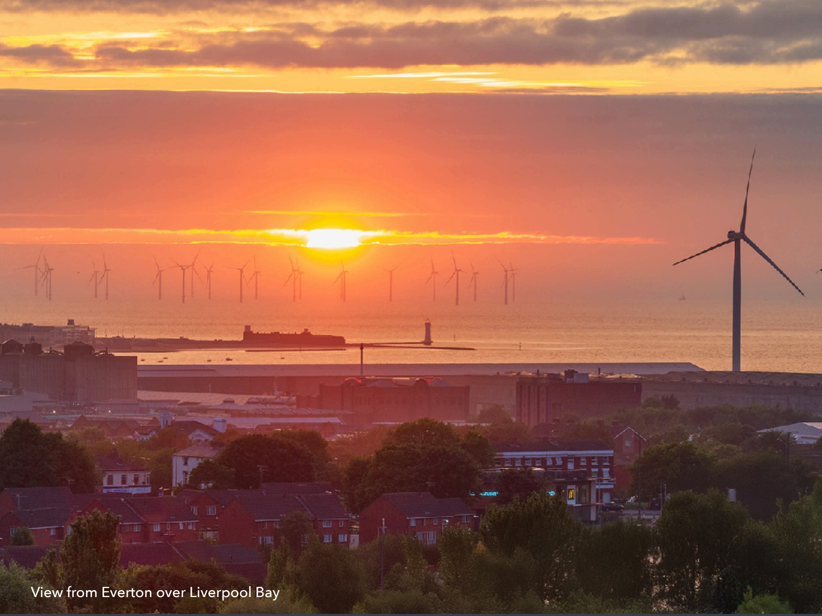
View from Everton over Liverpool Bay