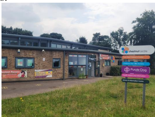
MEMBERS OF THE ASPIRE GROUP

The multi agency Chestnut Centre stands on a site adjacent to the church and has become a much needed asset in the parish. It is also used on a weekly basis by the Aspire group (Creating Communities) for anyone over 55) and is supported by the church. It provides social activities for older/isolated members of the community. This has proved to be a good link which we could expand upon. We hope that the presence of Aspire at the Centre will encourage relations between the parish and the church. The new incumbent may find ways to develop further links.