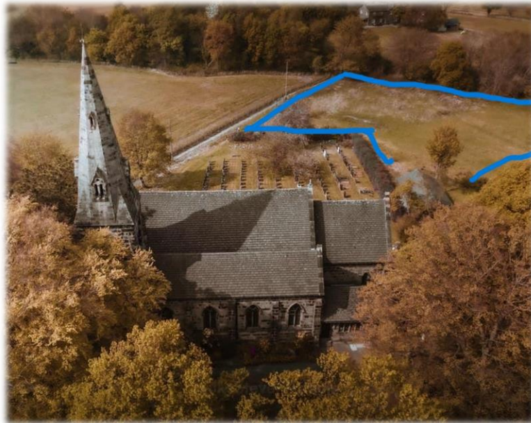
Glebe Land outlined in blue

However, there is little room left in the graveyard now and there is an ongoing project to alleviate this problem. Glebe Land adjacent to the burial ground belongs to the Diocese. We will be able to develop the glebe land for burials when land registration has been completed.