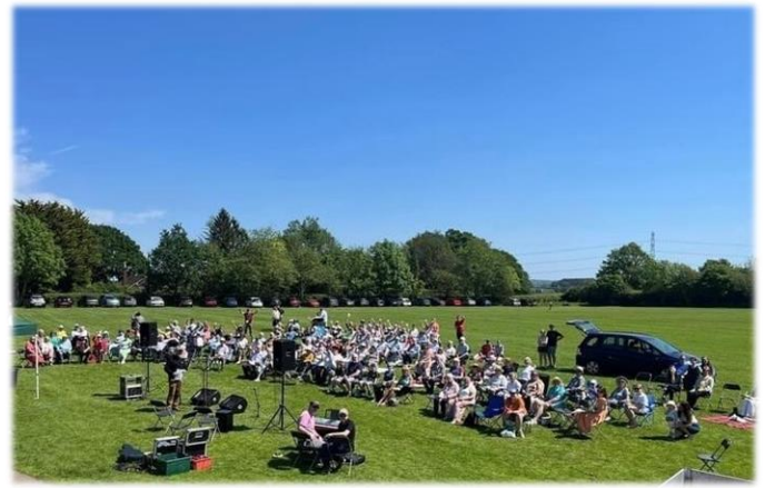
Local Cluster Pentecost Service

Whilst our church upholds the Fit for Mission priorities of